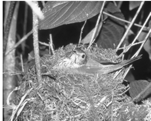
Figure 59. Although Swainson's Thrush is a fairly common summer visitor, only a single nest was found.