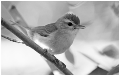
Figure 20. Warbling Vireo is the most common and widely distributed vireo in British Columbia, including the North Peace River region.

and patches of willow scrub. Breeding : Recorded in various forest types including mature balsam poplar floodplain forest ( e.g. , south Taylor), trembling aspen groves within lodgepole pine and white spruce forests ( e.g. , Mile 73, Alaska Highway), trembling aspen and balsam poplar forests ( e.g. , Beaton Provincial Park; Figure 21), and trembling aspen forest on south-facing hillsides ( e.g. , Bear Flat). In Alberta, Warbling Vireo inhabits the margins of riparian black cottonwoods, poplar bluffs, trembling aspen groves, and more rarely, mixed-woodlands (Salt and Salt 1976).