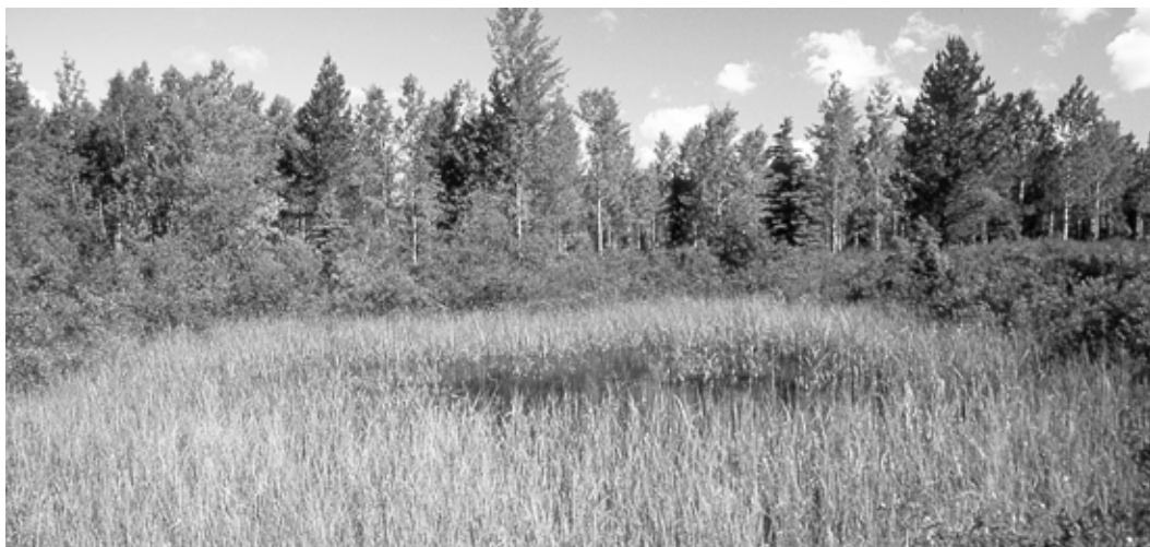
Figure 108. Song Sparrow breeds mainly close to wetlands, especially in shrub thickets surrounding marshes. north of Fort St. John, BC. 27 June 1998.

Breeding: Undoubtedly breeds in the North Peace River region but no nests were found. Campbell et al. (2001) gave a record of nestlings at Charlie Lake on 25 July 1964. Birds encountered at spring and summer locations were usually territorial males; occasionally agitated pairs were encountered. Other breeding evidence was a juvenile able to fly at Lost Lake near Boundary Lake on 15 July 1985, an independent juvenile at the mouth of Alces Creek on 2 July 1998, and an adult carrying food at the mouth of Farrell Creek on 1 July 1998.