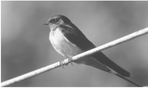
Figure 42. Like many insect-eating birds in British Columbia, Barn Swallow has extended its range northward in the province during the past four decades.

Habitat: Migration: Open and semi-open areas. It commonly feeds over wetlands, ponds and lakes, playing fields, seismic cuts, suburbia, and city parks. Breeding: Nesting recorded at farms, ranches, wetlands, grassy breaks above the Peace River, railway yards, gas well clearings, open edge of rivers, and on structures in small communities along the Alaska Highway.