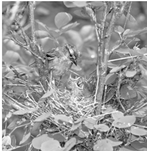
Figure 98. Adult Chipping Sparrow attending young in a nest built in the middle of a wild rose shrub.

Breeding: Evidence suggests that Chipping Sparrow formed pairs and began nesting in late May. A bird carrying nesting material was seen 23 May 1981 at Peace Island Park Road. Notable records are: A nest with four eggs being incubated was found 9 June 1985 at Fort St. John, a nest with at least two unfeathered young was found on 14 June 1981 at Mile 98, Alaska Highway, and another containing four downy nestlings was found on 16 June 1985 at Boundary Lake. Fledglings were frequently encountered in late June and early July. In the South Peace River region, Phinney (1998) found three nests on 11 June 1993: two with five eggs each and the other with four newly hatched young. A nest on 19 June 1994 contained two sparrow eggs and two Brown-headed Cowbird eggs.