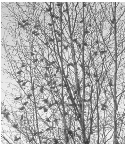
Figure 144. Small flocks of Common Redpolls are most often seen while feeding on seeds of alders and birches.

Habitat: Migration and Winter : Deciduous and mixed forests favouring birches and alders for seeds (Figure 144). It was also recorded in ornamental and shade birches in suburban yards and along roadways in Fort St. John. In the autumn and winter, Common Redpoll was also found in weedy patches at field edges, especially at Cecil Lake, and in stubble and un-harvested grain fields. It was sometimes encountered in early spring around spilled grain at grain elevators, sheds and farmyards at Montney. At all seasons it fed on grit and spilled grain on roadways through grain farming country. Occasionally it appeared at bird feeders.