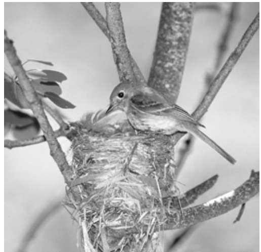
Figure 6. Alder Flycatcher is an uncommon summer visitor to riparian habitats throughout the North Peace River region.

Habitat: Migration and Breeding: Alder Flycatcher (Figure 6) arrives directly on its breeding grounds. Habitat includes a variety of dry and damp sites: willow thickets in overgrowing meadows (117 th Avenue, Fort St. John), willows and shrubs along streams (Prespatou Creek south of Prespatou), willow thickets around marshes (248A Road marshes), and shrub edge to muskegs and bogs (Boundary Lake). Alder Flycatcher also commonly occurred in shrub communities on exposed grassy slopes such as the Beaton River breaks. In the Fort MacKay area of northern Alberta, the species preferred tall willows without a tree canopy (Francis and Lumbis 1979), a description that also applies to the North Peace River region.