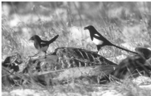
Figure 26. Vehicle-killed mammals, like this Mule Deer, attract scavenging Black-billed Magpies throughout the year.

Breeding: The large bulky stick nests built in the centre of willows, and occasionally other shrubs and saplings, are especially visible in the North Peace River country in winter (Figure 27). Nests are usually domed with sticks and twigs, having, as country children will point out, a “front door and a back door.” The earliest fledgling was seen near North Pine on 21 May 1980. Shorter-tailed juveniles, with attendant adults, were seen until late July. In the South Peace River region, where nests were investigated more thoroughly, eggs were laid between late April and early May, with an average clutch of 6.5 eggs. Hatching occurred in mid-May. The average brood size was 4.2 young at fledging. The number of nests sampled was not given (Phinney 1998).