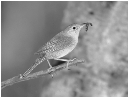
Figure 49. House Wren reaches the northern limit of its range in British Columbia in the Boreal and Taiga Plains ecoprovinces where it is uncommon in summer.

Not reported by Williams (1933b). Cowan (1939) found House Wren (Figure 49) common in the Swan Lake area but less abundant around Charlie Lake. Penner (1976) called it relatively “rare” in the Peace River valley, citing one record for 1973 and a second for 1975.