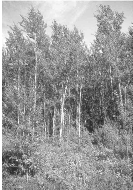
Figure 123. In summer, Rose-breasted Grosbeak breeds in pure and mixed trembling aspen forests. Photo by R. Wayne Campbell, Beaton Park, BC, 23 June 1998.

Habitat: Migration and Breeding: Middle-aged and mature deciduous and mixed forests including upland forested habitats (Figure 123) and older forests where these have been retained in the North Peace River region. The species also utilizes edges and secondary habitats and is relatively tolerant of human disturbance (Wyatt and Francis 2002).