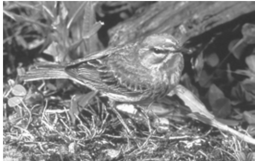
Figure 80. The breeding distribution and biology of Palm Warbler, restricted to northeastern British Columbia, are among the least known for any species in the province.

common. Foraging by Palm Warblers occurred throughout all levels of the habitat. The males often used dead spruce saplings as song perches.” The habitat description is fairly similar to that given for Alberta by Wilson (1996): “... borders of receding muskeg where a few black spruce, tamarack, and birch are scattered together with a loose growth of alder, willow, and creeping ericaceous shrubs.”