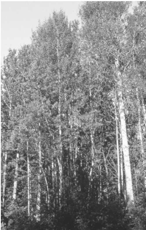
Figure 69. Tennessee Warbler breeds in a wide variety of forested habitats but prefers stands of pure trembling aspen with some shrub understory. Photo by R. Wayne Campbell, west of Fort St. John, BC, 11 July 2003.

Habitat: Migration: In spring, occurs in most woodland types. More widespread in late summer and early autumn when it occurs with other warbler migrants in woodland edges as well as willow thickets and other tall shrub communities. Breeding: Found in the North Peace River region in pure young trembling aspen groves (e.g., km 5 of Upper Cache Road; Figure 69), trembling aspen-balsam poplar mix (e.g., Beaton Provincial Park), alder-willow thickets, around black spruce muskeg (e.g., north of Boundary Lake), trembling aspen-tamarack-willow-birch and black spruce (e.g., km 2 of Upper Cache Road) and white spruce- trembling aspen woods (e.g., Dinosaur Lake).