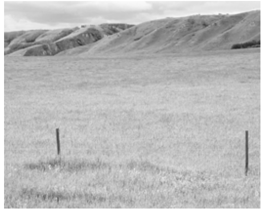
Figure 129. Western Meadowlark probably breeds in the agricultural fields near Bear Flat, BC, where it frequently has been seen singing from fence posts. Photo by R. Wayne Campbell, 18 June 1996.

Habitat: Grasslands “breaks” on south-facing slopes and fields on the north side of the Peace River (e.g., at Two Rivers and the south sewage lagoons in Fort St. John), and the edges of agricultural fields and grassy highway margins (e.g., at Bear Flat; Figure 129 and Taylor).