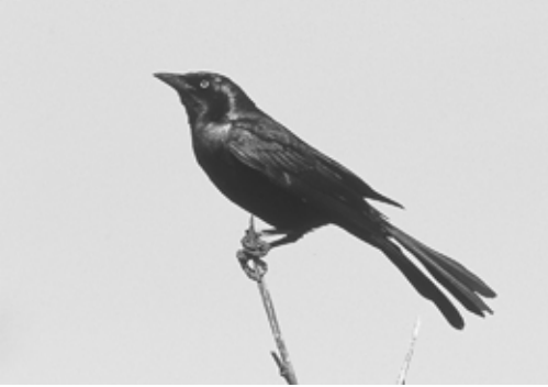
Figure 136. Over the past five decades, Common Grackle has become well established as a breeding species in northeastern British Columbia. Highest numbers occur in the Boreal Plains ecoprovince.

Distribution: Migration and Breeding : Recorded locally from the Halfway River eastward to the Alberta border and no farther north than Cecil Lake.