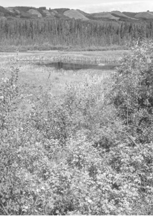
Figure 143. Purple Finches can regularly be heard in summer singing from the edges of mixed coniferous and deciduous forests surrounding wetlands created by Beavers. near Bear Flat (Watson Slough), BC, 28 June 2002.

Distribution: Migration and Breeding : Widely distributed across the forested parts of the North Peace River region.