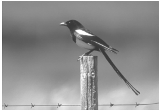
Figure 25. Black-billed Magpie, now resident in the North Peace River region, was unknown in the area until the 1940s.