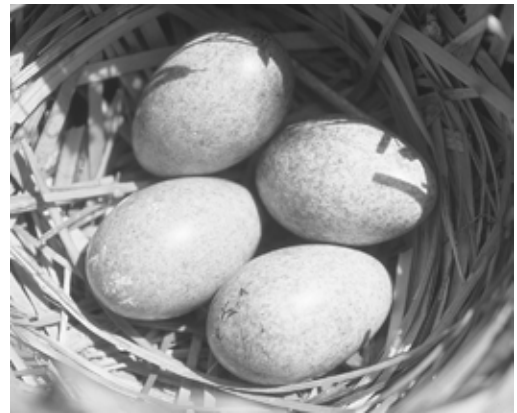
Figure 132. Full clutches of Yellow-headed Blackbird eggs may be found as early as mid-May in the North Peace River region.

(1998) found nests with eggs between 8 and 18 June. In the North Peace River region, newly fledged young were encountered annually around colonies from late June to mid-July. Backdating suggests that nest construction (Figure 132) and egg-laying began around the middle of May, incubation probably during the first half of June, and young were present in the nest during the last two weeks of June.