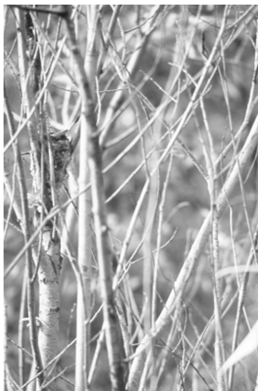
Figure 85. Often American Redstart nests are built in a crotch of a spindly stem of a dead willow sapling. This nest (top left) was 2.4 m above ground. Photo by R. Wayne Campbell, Taylor, BC, 12 June 1990.

Two nests were situated in a willow (Figure 85) and one in a balsam poplar sapling. Two of 25 broods were solely a Brown-headed Cowbird chick.