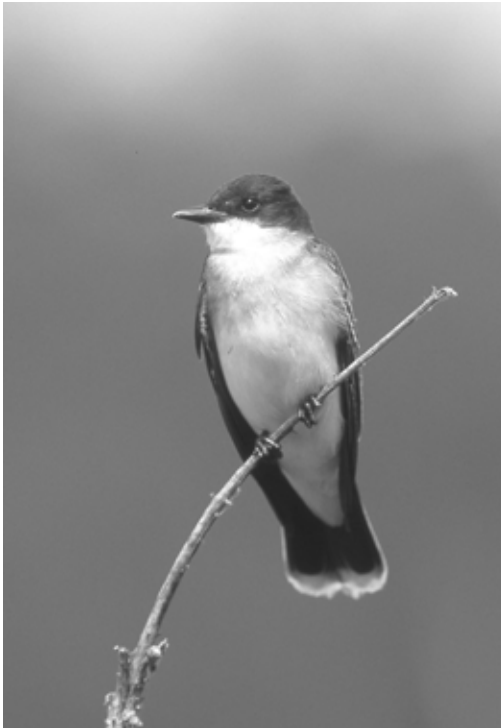
Figure 15. Eastern Kingbird is locally distributed throughout the southern portion of the North Peace River region, and often found close to water. Photo by R. Wayne Campbell, Watson Slough, BC, 23 June 1998.

“with quantities of dead trees and shrubs along the shores...” Similar habitat is found around Beaver ponds along Highway 29 near Watson Slough, around Charlie Lake, the 248A Road marshes, and Cecil Lake, as well as Boundary, German, and Lost lakes. The Eastern Kingbird was also found in drier areas around thickets and trembling aspen edge on south-facing hillsides (breaks) of the Peace River near Bear Flat and also the Beatton River.