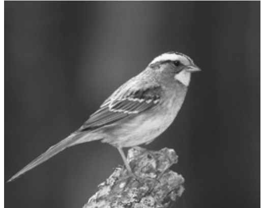
Figure 113. The highest numbers of White-throated Sparrows in summer occur in the Boreal and Taiga plains ecoprovinces of northeastern British Columbia.

Williams (1933b) found White-throated Sparrow (Figure 113) “common” in the Peace River Block. Cowan (1939) called it a “not uncommon” summer resident. Penner (1976) called it a “common summer resident” in the Peace River valley.