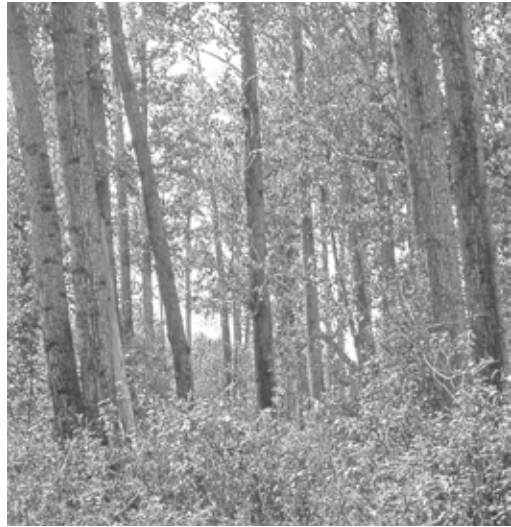
Figure 141. Baltimore Oriole breeds in mixed woodlands of open balsam poplar and trembling aspen. south of Taylor (Peace Island Park), BC, 23 June 1996.

Habitat: Migration and Breeding : Mainly along the edges of trembling aspen and balsam poplar groves and occasionally frequents open mixed woodland. It has also been recorded in balsam poplar flood plain forests along Peace Island Park Road (Figure 141) as well as around farms along Johnstone Road. The species was fairly common around young and middle-aged trembling aspen forests on the shores of Charlie Lake and in the rows of shade trees on the Charlie Lake golf course and around farmyards. There was one record of a male in mixed spruce-tamarack-balsam poplar-willow-trembling aspen at a wooded swamp along the Upper Cache Road. Baltimore Orioles were also seen in trembling aspen and mixed woodlands around beaver ponds at Bear Flat and near Watson Slough. This species appeared to favour woodlands that had been opened up by selective cutting.