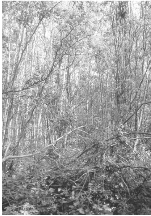
Figure 124. Rose-breasted Grosbeak nest (upper right) in tall clump of spindly willows in a trembling aspen forest. Photo by R. Wayne Campbell, Beaton Park, BC, 23 June 1996.

Breeding: There were two nest records as well as seven observations of fledglings or juveniles accompanied by adults. Nest-building probably commenced in early June. A pair was seen building a nest in a pole-stage trembling aspen forest (Figure 124) near the northwest end of Charlie Lake on 2 June 1985. R. Wayne Campbell (pers. comm.) found several nests in the crowns of mature willows throughout the Peace River area. An old nest from the previous year was found in a trembling aspen sapling near a water seep just north of Johnstone Road in 1980.