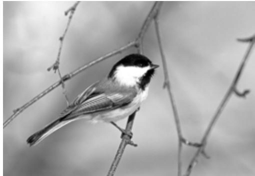
Figure 44. Black-capped Chickadee, a resident species, is a welcome visitor at bird feeders during the long Peace River winters.

Distribution: Found year-round throughout the North Peace River region.