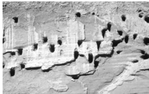
Figure 38. Most Bank Swallow colonies reported in British Columbia have information on absence or presence of attending adults but the contents of individual burrows are rarely examined.

Breeding: Two colonies (100 and 20 burrows) were located in the north bank of the Peace River near Farrell Creek on 26 July 1985. Another colony of between 15 and 38 pairs persisted in a road cut along 103 Road on the east side of the Beatton River from 1981 to 1987. Another colony of about 15 pairs was located along Highway 29 near the mouth of the Halfway River on 17 June 1978. However, there is no specific information on occupancy of nests in the study area (Figure 38).