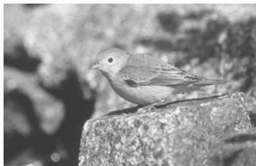
Figure 71. The highest numbers of Yellow Warbler in British Columbia are found in the Boreal Plains and Southern Interior Mountains ecoprovinces along the eastern boundary of the province.

Habitat: Migration: Similar habitat to Breeding . Breeding: Strong preference for deciduous woodlands and shrubby edges including balsam poplar stands, trembling aspen forests, and mixed forest edges. Common around streams, ponds, and lakes, in lines of willow and occasionally in treed backyards. It avoids heavy spruce growth. In Alberta, Yellow Warbler occurs along the edges of shrubby forests and is the only warbler to nest commonly in ornamental trees and shrubs near human dwellings (Salt 1973).