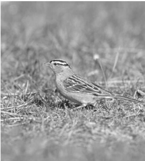
Figure 116. White-crowned Sparrow is primarily a spring transient in the North Peace River region.

Williams (1933b) suggested White-crowned Sparrow (Figure 116) was a “common migrant” through the Peace River Block. He also recorded it along the Halfway River on 2 July 1930. Cowan (1939) called it an “abundant May migrant.” He also reported that a few pairs remained to nest around Tupper in 1938. Penner (1976) designated it a “common migrant” in the valley of the Peace River.