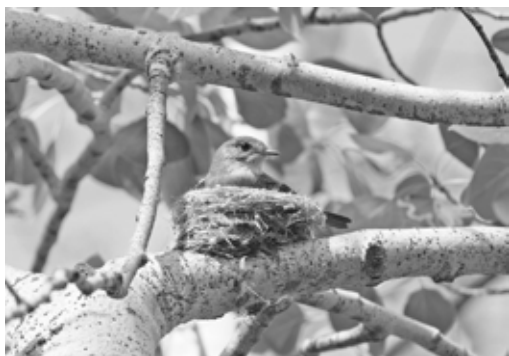
Figure 2. Western Wood-Pewee breeds in forested habitats throughout the southern two-thirds of the province as well as in the Boreal Plains ecoprovince where the North Peace River region is located.

Williams (1933b) found Western Wood-Pewee (Figure 2) common at “Little Prairie” (location unknown) in the Peace River Block from 3 to 10 August (year not given). Cowan (1939) recorded it as “fairly abundant” around Tupper Lake and Charlie Lake. Penner (1976) listed it as “common” in the Peace River valley.