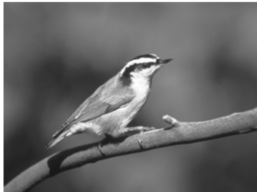
Figure 46. Red-breasted Nuthatch is primarily a migrant and summer visitor in the North Peace River region.

Habitat: Migration: During autumn Red-breasted Nuthatch (Figure 46) is often recorded in more open, less forested locations and is more likely to occur in pure trembling aspen forests and forests around muskeg habitats. Breeding: Recorded in mid-aged forests as nesting habitat. Such habitat is now more local in the North Peace River region due to logging. It favoured older mixed forests at Stoddart “Fish” Creek in Fort St. John and mixed woodlands around the mature spruce stand at Beatton Provincial Park, as well as mature forests along the Peace River. Red-breasted Nuthatch also frequented lodgepole pine forests at Hudson’s Hope.