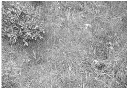
Figure 104. Typical ground nest of Savannah Sparrow (lower right) placed at the base of an overhanging clump of grass. Photo by R. Wayne Campbell, Boundary Lake, BC, 21 June 2004.

Breeding: Three nests were found (Figure 104). Nest-building commenced as early as the fourth week of May. An adult was recorded carrying nest material at the south sewage lagoons in Fort St. John on 24 May 1987. Two nests with three and five eggs were found at the 248A Road marshes in North Pine on 13 June 1983. This is within the time period for a nest with four eggs found at the south end of Charlie Lake on 14 June 1938 (Cowan 1939). In the South Peace River region, three nests with eggs were found between 27 and 30 May (Phinney 1998).