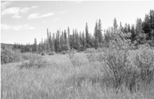
Figure 1. In the North Peace River region, Olive-sided Flycatcher often breeds in stands of mixed coniferous forests adjacent to open wetlands. An important component of breeding habitat is tall trees with dead tops or interspersed with snags that serve as singing and foraging perches. Photo by R. Wayne Campbell, Bear Flat, BC, 16 June 1990.

In the South Peace River region, Phinney (1998) described this species as frequenting mixed forests, especially near edges and openings, and also bogs. Altman and Sallabanks (2000) describe common features of all Olive-sided Flycatcher nesting habitats as: “tall, prominent trees and snags, which serve as singing and foraging perches, and unobstructed air space for foraging” (Figure 1).