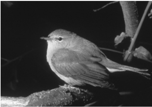
Figure 70. Orange-crowned Warbler is a fairly common migrant and summer visitor that probably breeds in edge habitats throughout the North Peace River region.

Not recorded by Williams (1933a,b). Cowan (1939) found Orange-crowned Warbler (Figure 70) “abundant.” Penner (1976) called it a “common summer resident” on the floodplain of the Peace River.