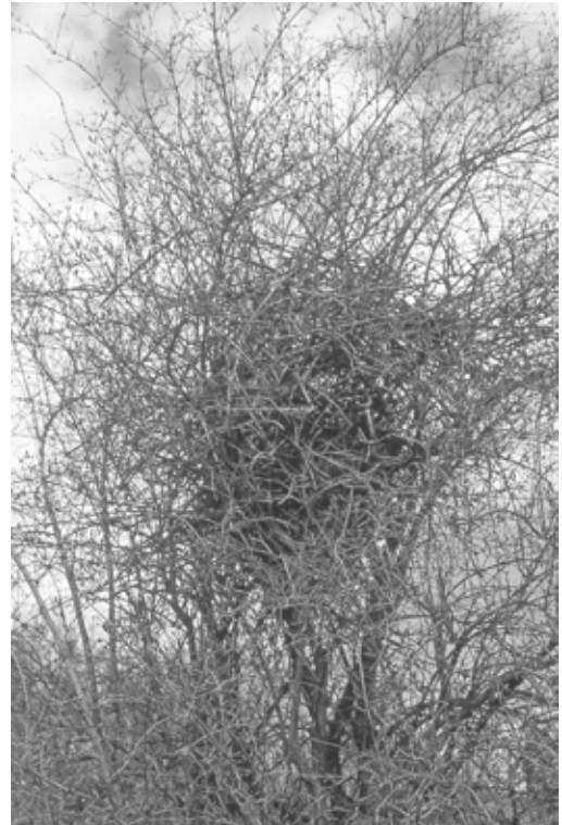
Figure 27. During the spring and summer breeding season, Black-billed Magpie nests are surprisingly well hidden. In autumn and winter, they become more visible.

Breeding: The large bulky stick nests built in the centre of willows, and occasionally other shrubs and saplings, are especially visible in the North Peace River country in winter (Figure 27). Nests are usually domed with sticks and twigs, having, as country children will point out, a “front door and a back door.” The earliest fledgling was seen near North Pine on 21 May 1980. Shorter-tailed juveniles, with attendant adults, were seen until late July. In the South Peace River region, where nests were investigated more thoroughly, eggs were laid between late April and early May, with an average clutch of 6.5 eggs. Hatching occurred in mid-May. The average brood size was 4.2 young at fledging. The number of nests sampled was not given (Phinney 1998).