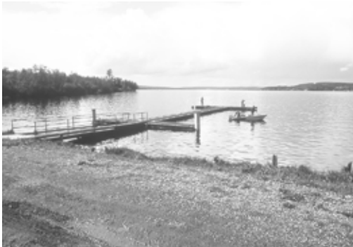
Figure 33. In spring, the largest numbers of migrant Tree Swallows were found foraging over Charlie Lake, BC. 10 June 2007.

1°C rain at Hudson's Hope on 5 May 1979; over 100 flying low over Peace River shore at Lynx Creek on 6 May 1979; four adults inspecting holes in snags at the south end of Charlie Lake on 7 May 1977; and 50 flying over the northwest corner of Cecil Lake on 12 May 1983. Summer : Nesting activities are mainly carried out in June. See Breeding . The southward exodus from the North Peace River region is unspectacular with no large flocks observed. There was only one record of 50 birds in July. By August, Tree Swallows were hard to find with only eight observations for the entire study period. Five final autumn records (1977, 1984, and 1986 to 1988) ranged from 9 August to 17 August. Notable records include Tree Swallows seen frequently at Alwin Holland Park, Hudson's Hope, on 6 June 1976; two over small ponds along British Columbia Rail depot in Fort St. John on 24 June 1987; three along the north causeway at Boundary Lake on 11 July 1984; 10 gathered at the south end of Charlie Lake on 9 August 1977; and one over the north sewage lagoons in Fort St. John's on 17 August 1984. The latter date is the latest departure record. Autumn : No records.