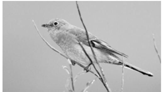
Figure 57. Townsend's Solitaire is a rare find from spring to autumn each year. While suitable nesting habitat exists, breeding has not been confirmed.