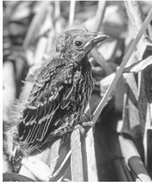
Figure 127. Fledged Red-winged Blackbird young, clinging to cattail stems and leaves, can be found in early June. Photo by R. Wayne Campbell, Grand Haven, BC, 9 June 2007.

young were found from the second and third weeks of June throughout mid-to late July; the latter dates were probably second nestings.