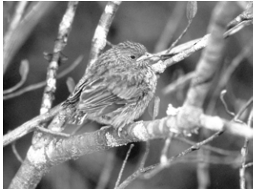
Figure 119. Most breeding records for Dark-eyed Junco are of recently fledged young.

Both nests were compact cups set in tiny depressions in north-facing road-cuts at the edge of a mixed forest. In the South Peace River region, Cowan (1939) and Phinney (1998) found eggs from 20 May to 23 June. Adults feeding fledglings in the North Peace River region were seen from 22 June to 11 July (Figure 119). Dark-eyed Juncos feeding juvenile Brown-headed Cowbirds were seen on 10 July 1987 at Beatton Provincial Park, and on 12 June 1988 and 21 June 1988 along the Peace Island Park Road.