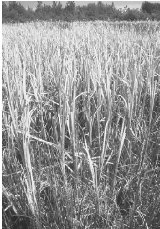
Figure 131. Yellow-headed Blackbird is a local breeding species that requires wetlands with dead cattail growth for nest attachment. Photo by R. Wayne Campbell, south of Fort St. John, BC, 22 June 2008.

Habitat: Migration: Recorded in flocks of other blackbirds in marshes, open lakeshores, farmyards, lawns, sewage lagoons, beaches and shorelines. Breeding: Colonies form in Typha latifolia and Scirpus spp. beds at marshy lakes and ponds (Figure 131). Birds feed in the marshes and in nearby fields and farms.