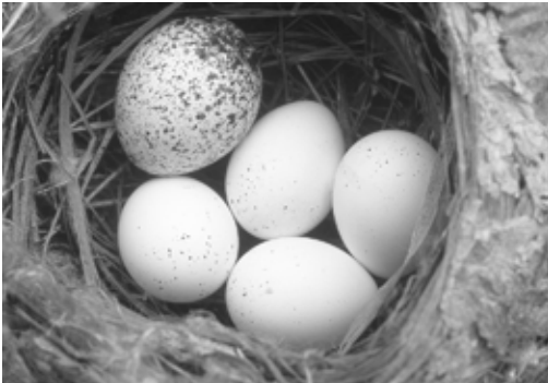
Figure 22. Nearly one-quarter of all Red-eyed Vireo nests reported in British Columbia were parasitized by Brown-headed Cowbird.

Breeding: No actual nests were found but Red-eyed Vireo probably nests locally throughout the North Peace River region. There were three records of adults feeding fledglings: One adult and one fledgling were seen at km 5 on the Johnstone Road on 24 July 1982 and 29 July 1982 and one adult with a fledgling just out of the nest was observed near the ski hill along Peace Island Park Road on 9 July 1997. Near Dawson Creek, in South Peace River region, Phinney (1998) found an empty nest on 15 June 1993; on 26 June it contained three vireo eggs and later two Brown-headed Cowbird eggs.