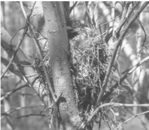
Figure 78. Nests of “Myrtle” Yellow-rumped Warblers are often lined with soft body feathers of grouse and owls.

Breeding: One nest (Figure 78) was found and several fledged broods were observed. Adults were seen gathering nesting material as early as 10 May. Fledged broods appeared in late June. Adults were commonly seen carrying food from mid-June through early July. Of 13 fledged broods, seven were found between 9 and 22 July. Yellow-rumped Warblers commonly have their nests parasitized by Brown-headed Cowbirds. Of 13 fledged broods, seven were composed of fledgling cowbirds.