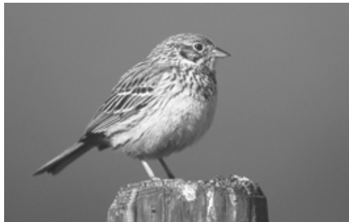
Figure 102. Vesper Sparrow is an uncommon migrant and reaches the northern limit of its breeding range in British Columbia near Hudson’s Hope.

Williams (1933b) found this species “common” in the Peace River Block. Cowan (1939) reported that it occurred “in fair numbers” in the Tupper Creek, Dawson Creek, and Charlie Lake area. Penner (1976) termed Vesper Sparrow (Figure 102) “uncommon” in the Peace River valley.