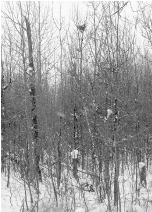
Figure 29. A good time to locate American Crow nests is during the year when leaves have fallen and nests stand out. The sites can be checked for activity the following spring. Photo by R. Wayne Campbell, Fort St. John, BC, 11 November 1996.

Cowan (1939) found his nests in the tops of willows along the shore of Swan Lake.