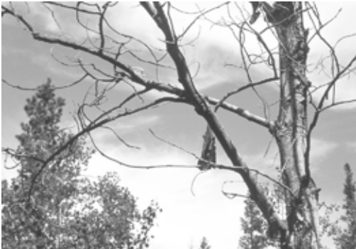
Figure 4. Western Wood-Pewee nests, found in live and dead trees, especially trembling aspen, are saddled on horizontal branches with forks well out from the trunk.

All 10 nests were built atop horizontal branches (Figure 4). Distance from the main trunk for four nests ranged from 0.5 to 1 m. Heights of 10 nests ranged from 5.2 to 9.1 m above ground, with 6 nests at 6 to 7.6 m. Nest construction began, in one case, as early as late May; a pair was seen working on a half- built nest at Montney Centennial Park at Charlie Lake on 30 May 1982. There were no clutch initiation dates.