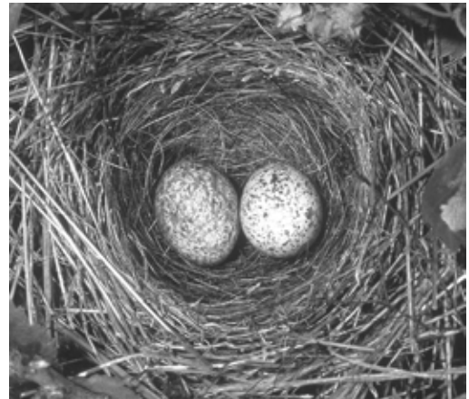
Figure 140. Chipping Sparrow is a common host for Brown-headed Cowbird and occasionally a nest is found with only Brown-headed Cowbird eggs, perhaps suggesting they were laid in the host nest after fledging.

Breeding: Fifteen species of birds in the North Peace River region were parasitized by Brown-headed Cowbird. Cowbird eggs were found in the nests of Spotted Sandpiper (1 nest; Siddle 2009), Yellow Warbler (2 nests), White-throated Sparrow (1), and Dark-eyed Junco (2). Cowbird fledglings were observed being fed by American Robin, Orange-crowned Warbler, Cape May Warbler, Yellow-rumped Warbler, Black-throated Green Warbler, American Redstart, Mourning Warbler, Canada Warbler, and Western Tanager (Campbell et al. 2001). Cowan (1939) found Hermit Thrush and Dark-eyed Junco to be the main hosts in May 1938 in both the North and South Peace River regions. Phinney (1998) found 16 host species near Dawson Creek of which Least Flycatcher, Hermit Thrush, Yellow-rumped Warbler, Yellow Warbler, Chipping Sparrow (Figure 140), Clay-colored Sparrow, Savannah Sparrow, Lincoln’s Sparrow, White-throated Sparrow, Dark-eyed Junco, Red-winged Blackbird, and Purple Finch were the most common hosts.