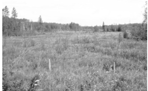
Figure 88. In migration and during the breeding season, Northern Waterthrush is closely associated with a wide variety of wetlands. along Upper Cache Creek Road, 19 June 1996.

Habitat: Migration: Appears in a wide range of habitats that includes wooded ponds, dugouts, watery ditches that have some brush around them, and in wooded upland situations. Breeding: Occurs around wooded lakeshores, ponds, streams, and large depressions filled with water within both deciduous and coniferous forests. The species has been found along the shores of Charlie Lake, in a wooded swamp along the Upper Cache Creek Road (Figure 88), at a small water-filled excavation along Johnstone Road, and around a beaver pond at the base of the hills at Bear Flat.