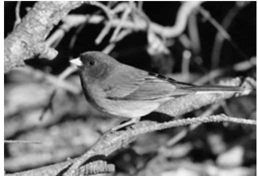
Figure 118. The “Oregon” race of the Dark-eyed Junco ( J. h. oregonus ) is the less common of the two races present in the North Peace River region.

Williams (1933b) listed junco as “common.” Cowan (1939) encountered one of the “Slate-colored” races in the woods of the South Peace River area, reporting two nests. He also found, but less commonly, “Oregon” Juncos (Figure 118) breeding at Tupper Creek and Charlie Lake. Penner (1976) found the Dark-eyed Junco to be a “common migrant and summer breeder” in the valley of the Peace River.