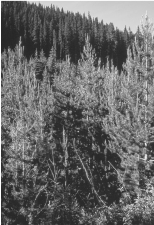
Figure 5. Yellow-bellied Flycatcher, a little known species in British Columbia that appears to inhabit pockets of discreet habitat in north-central interior parts of the province, was found to be regular summer visitor in regenerating stands of lodgepole pine.