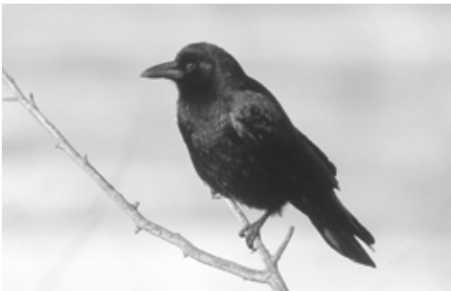
Figure 28. In the North Peace River region, American Crow is a highly migratory species, unlike its year-round status across southern British Columbia.

Williams (1933b) called the American Crow (Figure 28) “occasional to rare” in wilder parts of the Peace River District in 1922 and 1930. He predicted that it was likely to increase with settlement. Cowan (1939) designated it “abundant” around Swan Lake and Charlie Lake in 1938 and reported five nests at the former location. Penner (1976) called it a “fairly common summer resident” of the Peace River valley.