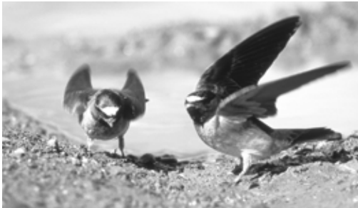
Figure 39. By late May, Cliff Swallows are starting to collect mud for nests throughout the North Peace River region.

Williams (1933b) found colonies along the Blueberry River in 1922 and at Cache Creek and the Gates (the Peace River at Hudson's Hope) in 1930. Cowan (1939) called Cliff Swallow (Figure 39) "exceedingly abundant" around Tupper Creek in the South Peace River region. Penner (1976) found it "very common" along the western half of the Peace River valley, and less common farther downstream.