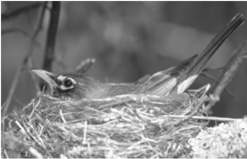
Figure 62. Female American Robin incubating at Beaton Park, BC. Photo by R. Wayne Campbell, 23 June 1996.

female constructing a nest along Peace Island Park Road 19 May 1986, two adults and two juveniles in the campground at Beaton Provincial Park on 19 June 1986, a nest with two eggs along the north edge of Beaton Provincial Park on 12 June 1983, a nest with three eggs at km 6 along Johnstone Road on 13 June 1982, one well-fledged juvenile at Hudson's Hope on 28 June 1980, and adults feeding week-old chicks in a nest in Fort St. John on 29 June 1977. Fifteen nests were located in balsam poplar (3), trembling aspen (4; Figure 62), alder (2), willow (3), Manitoba maple (2), and white spruce (1). Other nest sites included a willow stump in a clear cut and the top rung of a ladder hanging on the side of a shed.