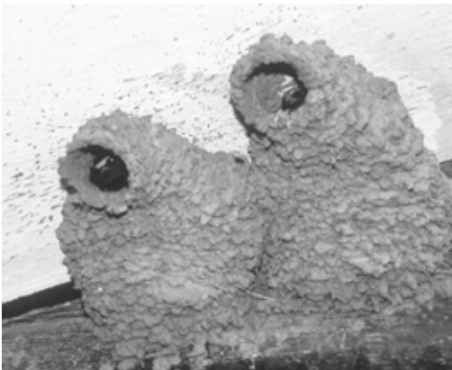
Figure 41. Nesting Cliff Swallows require access to damp mud that has the consistency and texture to provide the necessary adhesive bonding used in their nests.

Breeding: Colonies in the North Peace River area ranged from 10 to 300 nests. Both natural and human-made sites were used. Colonies were located on “teapot rocks” in the Peace River at Hudson’s Hope and Lynx Creek, as well as river cliff sites 10 and 18 km east of Hudson’s Hope. A colony was established on the Halfway River highway bridge in 1996 (R. Wayne Campbell pers. comm.). West of Fort St. John, a few pairs nested in the rimrock of a canyon along Tea Creek near Grand Haven. In Fort St. John, a colony was established on the community arena (Figure 41). Pairs were seen on the cliffs above the confluence of the Beaton River and Stoddart Creek. A large colony was situated on the Clayhurst bridge across the Peace River. In the northern part of the study area small colonies were recorded at the 101 Road bridge over the Blueberry River and on various buildings at Wonowon.