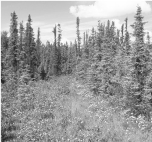
Figure 82. One of the less than 10 Blackpoll Warbler nests known for British Columbia was saddled on a branch of a small spruce tree at the edge of a muskeg near Boundary Lake, BC. Photo by R. Wayne Campbell, 24 June 1996.

Habitat: Migration: Frequented bushes and trees along lakeshores, creeks, ponds and sewage cells, as well as mixed woodland and trembling aspen forest edges and willow thickets. Migrant Blackpoll Warblers were commonly associated with riparian thickets. Breeding: Trees and thickets at muskeg edges (Figure 82). Territorial males were found along the edges of black spruce muskegs where alders and willows form thickets. Phinney (1998) described its Dawson Creek area breeding habitat as “thickets, swales, and young forests.”