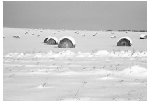
Figure 122. In winter, flocks of Snow Buntings feed on the seeds of plants jutting above the snow layer in open areas. Photo by R. Wayne Campbell, east of Fort St. John, BC, 10 November 1996.

Distribution: Migration and Winter : Most commonly observed in open country from Fort St. John east to Boundary Lake (Figure 122). In the west, it was seen at Farrell Creek community pasture and along the Upper Cache Road, Bear Flat, Charlie Lake, and north to Buick Creek.