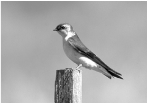
Figure 35. During the past six decades, Violet-green Swallow has become well established in the North Peace River region, but it is a habitat specialist and therefore occurs locally.

This species was first recorded in the Peace River region by Williams (1933b) at Hudson's Hope on 12 and 13 July 1930. Cowan (1939) considered the Violet-green Swallow (Figure 35) to be one of the rarest swallows in the British Columbia Peace River area; he only found it at Fort St. John and Charlie Lake. Penner (1976), who carried out the most extensive investigations in the species' preferred range and habitat, found it "fairly common" in the Peace River canyon (now flooded by the Site One dam) and "considerably more scarce" farther downstream where he noted it as a breeding species.