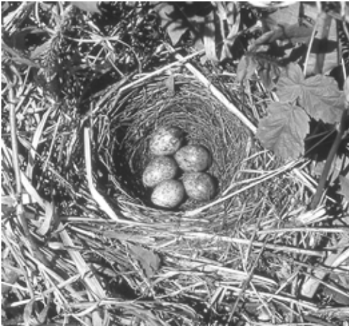
Figure 135. Small numbers of Brewer's Blackbirds build their nest on the ground at scattered locations throughout the North Peace River region, mainly along roadsides. south of Hudson's Hope, BC, 28 May 2004.

Breeding: Regularly bred in small colonies of fewer than 10 pairs, usually building their nests in shrubs and saplings that border open country. Pairs were also seen in breeding season in receding black spruce muskegs close to fields around Goodlow. Both Phinney (1998) and Campbell et al. (2001) reported Brewer's Blackbirds nesting on the ground (Figure 135). In the Fort St. John area, nests in trees were commonly situated next to the trunks of white spruce or in the centre of willows.