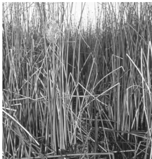
Figure 52. Marsh Wren nests (upper left) are usually interwoven around many stems of bulrushes or cattails.

Breeding: Most records were from the marshes at Boundary Lake. These were: A nest (Figure 52) with four eggs was found on 24 June 1996 (R. Wayne Campbell pers. comm.), a brood of recently fledged young was seen on 21 July 1987; a begging fledgling, still showing traces of down, was seen on 11 August 1984; and a fledged family of five was recorded on 22 August 1984. The only other breeding record was of a tailless fledgling seen at the 248A Road marshes on 4 August 1977. In the Dawson Creek area, Phinney (1998) found a nest with seven eggs on 10 June 1995 and another, also with seven eggs, on 18 June 1993.