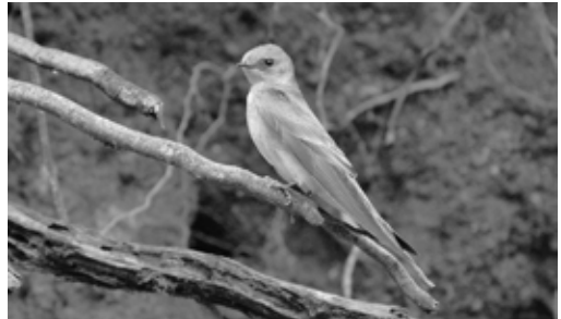
Figure 37. Northern Rough-winged Swallow may be more common than records indicate as summer locations are along major rivers with dirt banks that require boats for access.

Neither Williams (1933b) nor Cowan (1939) encountered this species. Penner (1976) gave one spring record (31 May 1973) for the Hudson's Hope area and called Northern Rough-winged Swallow (Figure 37) "rare, and probably a straggler."