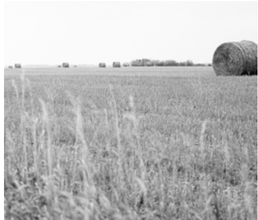
Figure 121. The largest flocks of migrating Lapland Longspurs in British Columbia have been reported foraging in bare agricultural fields in autumn in the North Peace River region. Photo by R. Wayne Campbell, North Pine, BC, 24 October 1991.

Habitat: Migration: Open country including bare agricultural and stubble fields (Figure 121). Following winters with heavy snow, the earliest longspurs were found along roadsides and field edges free of snow. Ponds, dugouts, ditches, and sewage ponds are important watering spots where hundreds of birds flocked to drink.