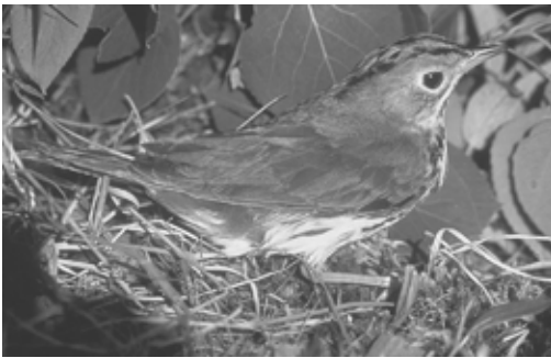
Figure 86. Although widely distributed each summer in the North Peace River region, no Ovenbird nests have been found.

Not recorded by Williams (1933b). Cowan (1939) found this species “dominant” in second-growth trembling aspen around Tupper Creek in the South Peace River region and “abundant” in dense aspen thickets and spruce forest at Charlie Lake. Penner (1976) called Ovenbird (Figure 86) a “common summer resident” of the Peace River valley.