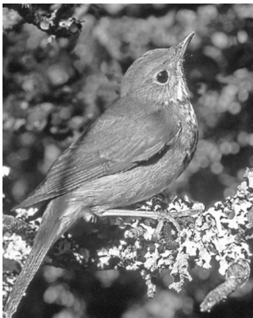
Figure 60. Generally considered a subalpine species in much of British Columbia, in the North Peace River region Hermit Thrush occurs in mixed forests throughout the area.

Habitat: Migration: During southbound passage, this species accepted a wider variety of habitats including willow and dogwood thickets, and balsam poplar riparian forest. Breeding: Several types of woodlands including trembling aspen ( e.g. , mid-causeway on west side of Boundary Lake), swamp aspen-poplar woods ( e.g. , Swanson Lumber Road in Fort St. John), aspen-black spruce interface ( e.g. , German Lake and Boundary Lake), white spruce-tamarack-aspen-willow-swamp birch ( e.g. , Watson Slough), and lodgepole pine-aspen ( e.g. , Hudson's Hope). In the South Peace River region, Phinney (1998) described pole-stage trembling aspen as its primary habitat.