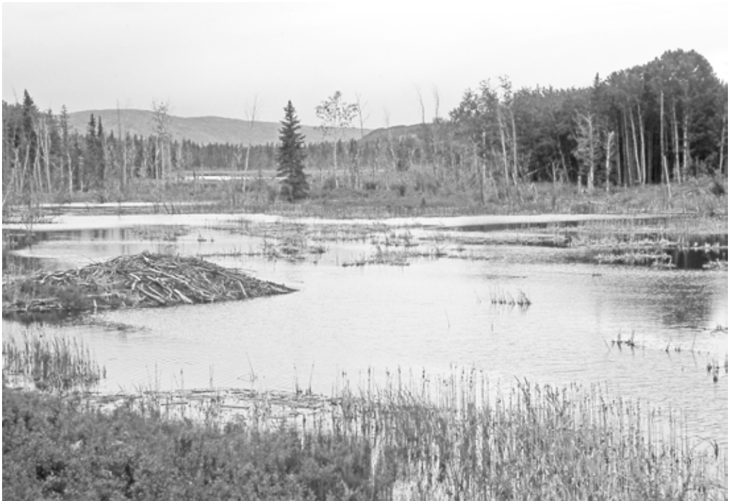
Figure 90. Beaver ponds are one of the many wetland habitats Common Yellowthroat visits each summer to breed. west of Charlie Lake, BC, 18 June 1996.

Distribution: Migration: Widespread. Recorded at Rose Prairie, Baldonnel, Beatton Provincial Park, north and south sewage lagoons in Fort St. John, the British Columbia Rail depot area in Fort St. John, Stoddart (Fish) Creek, and St. John Creek. Breeding: Fairly widespread, occurred from the south bank of the Peace River at Peace Island Park Road and Johnstone Road north to Wonowon. This species was not recorded from Hudson’s Hope, perhaps due