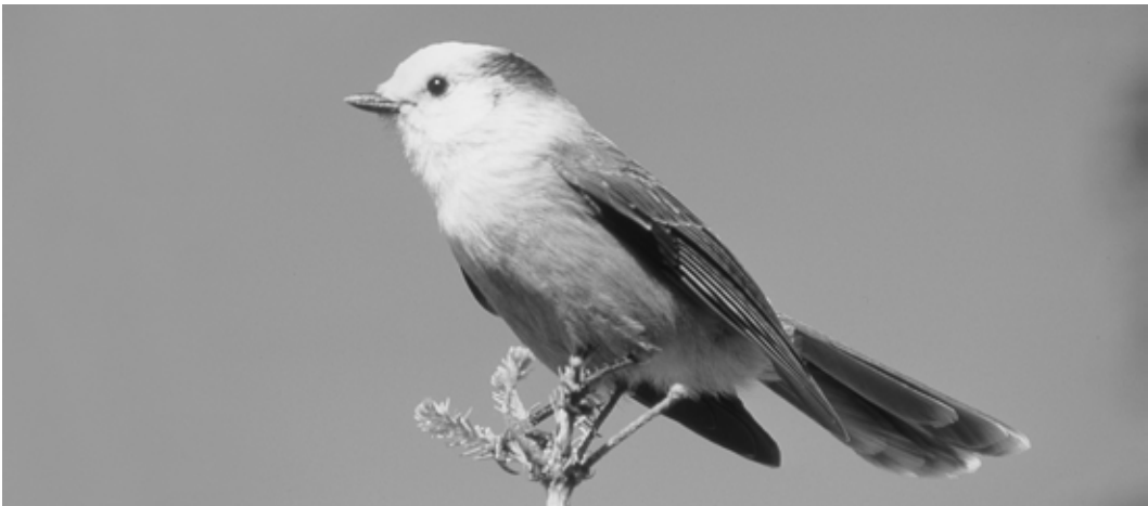
Figure 24. Throughout the North Peace River region, the subspecies of Gray Jay ( P. c. albescens) is lighter overall than the darker coastal race with intermediate plumages being reported.