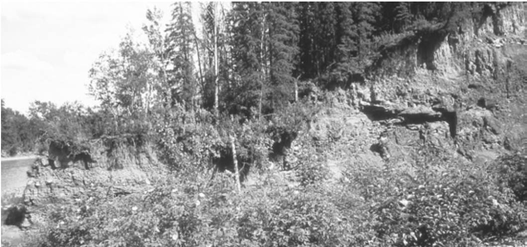
Figure 11. Crevices in earthen banks and cliffs along rivers and steep road cuts are used by Eastern Phoebe for nesting. The nest in this photo was located under overhanging vegetation near the top of the cliff. Photo by R. Wayne Campbell, Beatton River, BC, 23 June 2008.