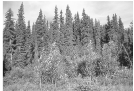
Figure 19. Blue-headed Vireo, a breeding species restricted to northeastern British Columbia, frequents a variety of mixed woodlands including old-growth white spruce. Photo by R. Wayne Campbell, near Hudson's Hope, BC, 23 June 1998.

Habitat: Migration: Similar forest types as "Breeding", as well as thickets around open areas. Breeding: Found in mixed woodlands where stands of conifers occur where it nests and forages extensively (James 1998). In the North Peace River region, Blue-headed Vireo occurs in old-growth white spruce with mature trembling aspens (e.g., Fish Creek; Figure 19), balsam poplars with white spruce (e.g., Peace Island Park Road and Beatton Provincial Park), trembling aspen-balsam poplar forests with scattered white spruce (e.g., Alwin Holland Park and Upper Cache Road), and young lodgepole pine stands with willow thickets (e.g., several kilometres east of Buick Creek).