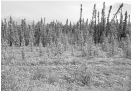
Figure 81. Muskegs with Labrador tea and Sphagnum moss adjacent to tall stands of spruce trees is the breeding habitat for Palm Warbler. near Boundary Lake, BC, 19 June 1996.

region. The earliest obvious migrant was a single bird at the old 103 Road bridge over the Beatton River on 19 August 1984. The remaining 15 records of southbound migrants occurred between 30 August and 14 September. Seven of these observations occurred near Boundary Lake, but the birds had shifted from muskeg to roadside habitat, often appearing on the dikes that lead to gas wells on the lake. Autumn migrants were encountered as singles, often among a flock of Yellow-rumped Warblers, or as small flocks of two to eight birds. The largest group encountered was a flock of eight birds at Boundary Lake on 26 August 1986 and eight again on 20 August 1987. Eight final autumn dates (1980 to 1982 and 1984 to 1988) ranged from 20 August to 14 September. Notable records are: A female 20 km south of Prespatou on 13 June 1981, six near German Lake on 15 June 1980, three males at Boundary Lake on 4 June 1983, one at Charlie Lake Provincial Park on 28 August 1978, one at the south end of Charlie Lake on 4 September 1981, one at the south sewage lagoons in Fort St. John on 14 September 1985 (latest autumn record), and one at Cecil Lake on 21 August 1980.