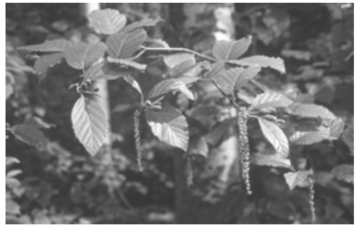
Figure 91. Green alder, a large shrub that ranges across the cooler parts of the Northern Hemisphere, is an important constituent of habitat for breeding Canada Warbler. Photo by R. Wayne Campbell, 22 June 2007.

Habitat: Migration: Mixed forests. Breeding: Found most frequently in the tall understory of mixed trembling aspen forests growing on slopes. Small openings in the canopy created by fallen trees allow the growth of a fairly thick understory of green alder (Figure 91), red-osier dogwood, highbush cranberry, and other tall shrubs.