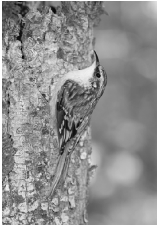
Figure 48. The Brown Creeper, a secretive habitat specialist, may be present year-round but locally distributed.

Habitat and Distribution: Brown Creeper (Figure 48) is usually found in a large stand of mature white spruce, from November through March, at Stoddart “Fish” Creek in Fort St. John; occasionally it was seen in mature balsam poplars at the Taylor ski hill at the west end of Peace Island Park Road in August.