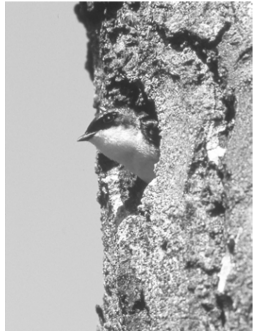
Figure 34. The breeding biology of Tree Swallow in the North Peace River region is poorly known, as most nest sites are in inaccessible natural cavities in trembling aspens.

of Taylor. Confirmed breeding records follow. A female incubated eggs or brooded nestlings in a nest box on 7 June 1983 on 281A Road. Nestlings were in a nest box on 30 June 1987 at the north sewage lagoons in Fort St. John. Two adults fed three fledged but dependent young on 8 July 1976 at Charlie Lake. Ten nest sites have been found in holes in deciduous snags near water (5), in nest boxes (3) not necessarily near water, and in a tubular iron crosspiece of a swing set at Peace Island Park (2). In the Dawson Creek area, Phinney (1998) found eggs in two nests on 3 and 4 June 1992.