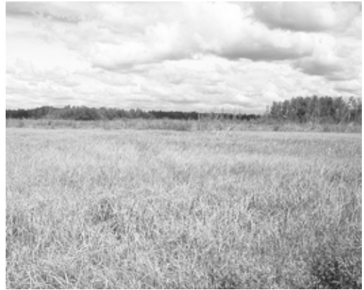
Figure 105. Le Conte's Sparrow probably arrives directly on its breeding grounds, primarily in wet sedge meadows. Boundary Lake, BC, 24 June 1996.

Distribution: Migration: No records. Breeding: See Habitat for details. It is locally distributed in a few marshes and certain field edges from Watson Slough east to Boundary Lake.