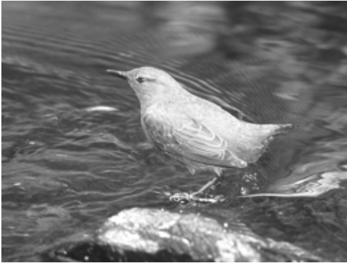
Figure 53. Clear, fast-flowing creeks and rivers give the American Dipper a local distribution in the North Peace River region.

Not recorded by Williams (1933b), Cowan (1939), or Penner (1976).