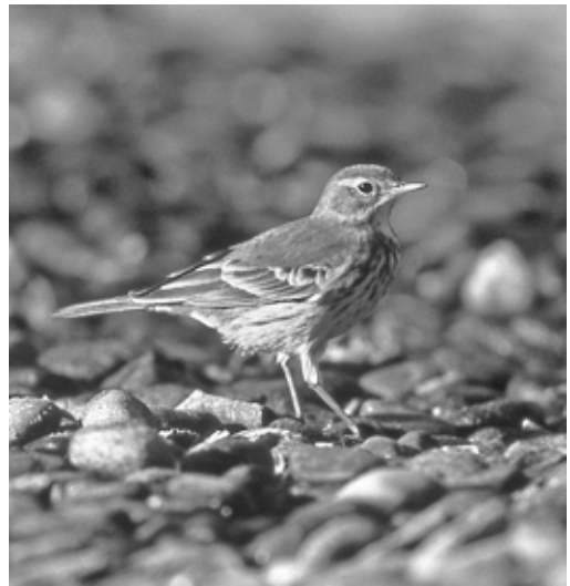
Figure 66. American Pipit passes through the North Peace River region to and from its alpine breeding areas.

Williams (1933b) found American Pipit “common” at Arras and Sunset Prairie, both in the South Peace River region, from 28 August to 2 September 1930. Cowan (1939) found American Pipit (Figure 66) in small flocks at Tupper Creek from the party’s arrival on 6 May to about 15 May 1938. Penner (1976) termed the American Pipit (known then as Water Pipit) a “common to abundant migrant” in the Peace River valley.