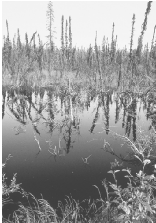
Figure 112. Wetlands with drowned branches of shrubs and small trees are a favourite breeding habitat for Swamp Sparrow. north of Fort St. John, BC, 2 July 2006.

Local. Found around swamps at the British Columbia Rail depot of east Fort St. John, the 248A Road marshes near North Pine, Cecil Lake, 219A Road at 103 Road near Goodlow, German Lake, Lost Lake, and Boundary Lake. It formerly bred at the south end of Charlie Lake. Along Highway 29, it occurs at Watson Slough and along the Upper Cache Road at km 1, 2.5, and 11. It was also recorded at swamps between Hudson’s Hope and the W.A.C. Bennett Dam.