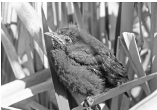
Figure 138. Fledgling Common Grackles, perching and climbing among cattail stems, can be found as early as 14 June. Most young, however, leave their nest a week later. Photo by R. Wayne Campbell, Grand Haven, BC, 22 June 1996.

The breeding phenology suggests that nests were built and eggs were laid and incubated in May through June, adults fed nestlings through early to late June, and fledglings appeared from the second week of June through July (Figure 138).