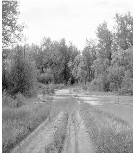
Figure 87. Even during years of flooding, Ovenbirds can be heard singing on territory in mature balsam poplar woods associated with various age stands of willows. Photo by R. Wayne Campbell, near Taylor, BC, 12 June 1990.

Habitat: Migration and Breeding : Primarily found in mature mixed woodlands along the south bank of the Peace River. These forests are made up of mature white spruce, trembling aspen, balsam poplar, birch and alder. It also is found in mature balsam poplar floodplain forests with alder and willow edges (Figure 87) and some small clumps of white spruce, young aspen forests ( e.g. , Boundary Lake), and mixed young and mature aspen forests ( e.g. , Beaton Provincial Park). All wooded habitats have a closed canopy, a fairly dense understory, little or no shrub layer, and an abundance of leaf litter. See Phinney (1998) for a description of South Peace River region habitat.