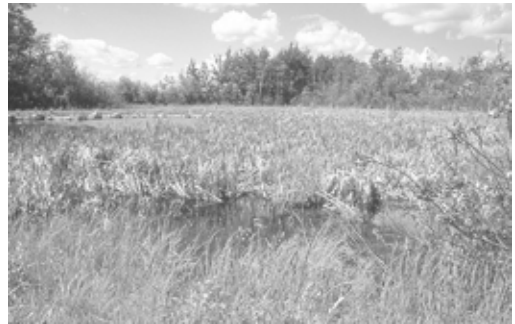
Figure 126. Almost any cattail marsh in the North Peace River region may support nesting Red-winged Blackbirds. An important component of the vegetation is some standing water and a mixture of dead cattails in which nests are built. north of Taylor, BC, 7 June 2007.

fields. Breeding: Uncommon in dry brushy upland meadows. It favours cattail (Figure 126) and bulrush stands in ponds and also frequents sloughs, beaver ponds, sewage lagoons, lakes with emergent wetland plants, as well as willows and cattails in ditches and dugouts. Although Red-winged Blackbird prefers open, non-forested wetlands, it has a high tolerance for human-altered environments. Occasionally, the species may forage in trembling aspen canopies if close to a wetland where emerging aquatic insects, such as chironomids, become available.