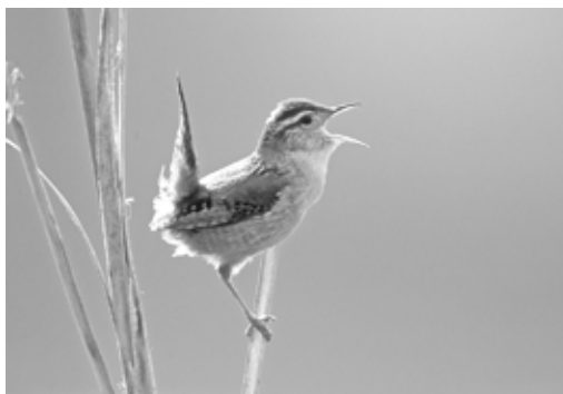
Figure 51. Marsh Wren is another wetland species that has moved recently into northeastern British Columbia, likely from northwestern Alberta.

Distribution: Migration: See Breeding . Marsh Wren (Figure 51) has also appeared at the north sewage lagoons in Fort St. John. Breeding: Very local. Found at Cecil Lake, Boundary Lake, the 248A Road marshes near North Pine, and Watson Slough along Highway 29. There is also an observation of one at the swamp at km 10 on the Upper Cache Road.