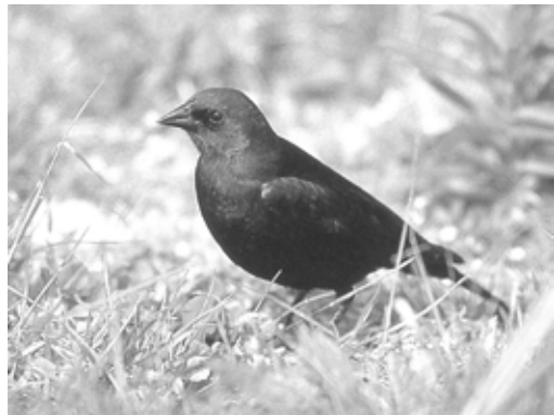
Figure 139. Brown-headed Cowbird breeds in the North Peace River region but is also a fairly common spring and autumn migrant.