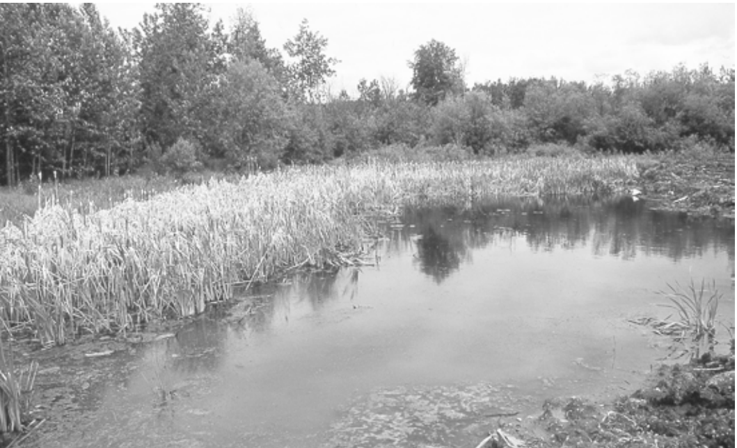
Figure 137. Small cattail wetlands, with the previous year's dead growth, are often used as breeding sites for Common Grackle. Photo by R. Wayne Campbell, Grand Haven, BC, 22 June 1996.

Occurrence: Spring : Eleven earliest spring arrival dates (1976, 1977, and 1980 to 1988) ranged from 14 to 30 April, with nine dates between 14 and 23 April. In the South Peace region, 21 April was given as the earliest arrival date (Phinney 1998). Earliest arriving birds were usually found at traditional breeding locations in flocks of up to 15 birds. The largest spring flock was 30 grackles at a newly seeded field at the south end of Charlie Lake on 24 April 1984. Notable records are: One at Watson Slough on 4 May 1980, two at the south end of Charlie Lake on 16 April 1976 (arrival date), seven at the British Columbia Rail depot in Fort St. John on 22 April 1988, and nine in farmyard along 248A Road near North Pine on 18 April 1988. Summer : Breeding activities commenced in late spring and continued into July. Grackles seemed to disappear sometime in late July, leaving a few stragglers into August. Late summer records, although few in number, were still consistent with final southbound movement from mid- to late August. Six final departure records (1975, 1979, and 1984 to 1987) ranged from 16 to