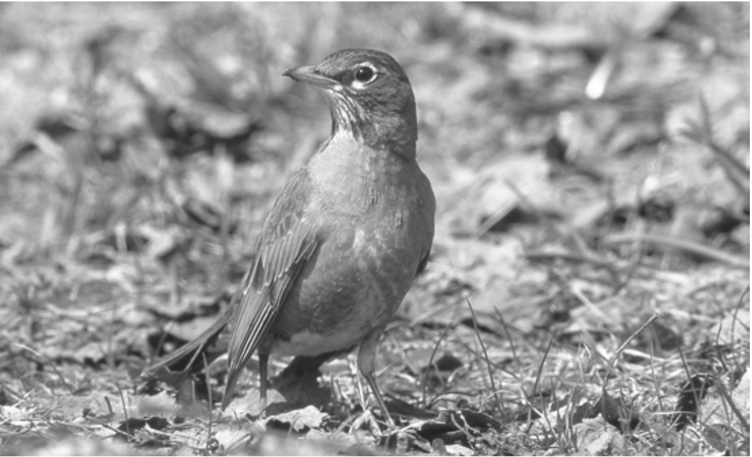
Figure 61. American Robin migrates and breeds in a wide variety of habitats including the edges trembling aspen forests, lakeshores, transmission corridors, and urban areas. Photo by R. Wayne Campbell, Beatton Park, BC, 23 June 1996.

end of Cecil Lake on 30 April 1986. Summer: See Breeding . Small assemblies of robins concentrate around Saskatoon berry bushes in early July, but are not migratory flocks. Small apparent migratory flocks first appear in early or mid-August. The earliest post-breeding flocks were 54 birds at St. John Creek near 101 Road on 11 August 1977, and 19 birds along Peace Island Park Road on 13 August 1988. The largest late summer flocks were noticed between 24 August and 23 September. A notable record is 20 robins feeding in a mountain ash in Fort St. John on 27 August 1980. Autumn: Seven final autumn records (1982 to 1988) ranged from 3 October to 13 November. Latest records (10 and 13 November) were of single birds staying very close to mountain ash trees in cold weather. Notable records are: at least 100 in dogwood bushes at the southeast corner of Charlie Lake on 12 September 1982, 300 in dogwood bushes along Peace Island Park Road on 23 September 1984, and one in a mountain ash tree on 13 November 1982 (final autumn record). Winter: