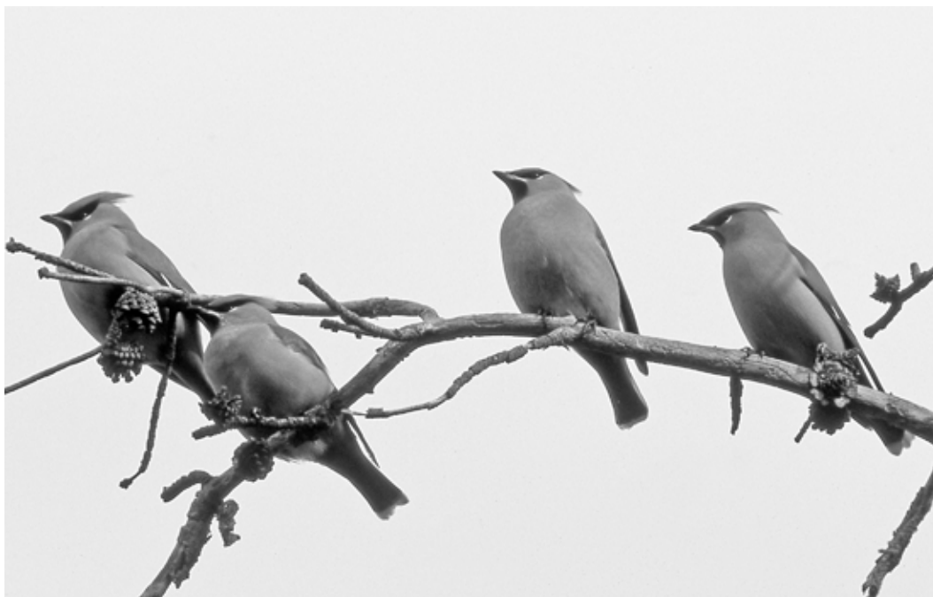
Figure 67. Bohemian Waxwing is primarily a common migrant in the North Peace River region.

are: A pair in muskeg at Boundary Lake on 13 June 1983 (Mike Shepard pers. comm.), three flying over muskeg at Boundary Lake on 24 June 1984, one at km 1 of the Upper Cache Road on 9 June 1985, and one at German Lake on 11 July 1986. Autumn and Winter : Generally arrived in the Fort St. John area in October or early November, although somewhat erratic. It was more frequent some winters than others. Bohemian Waxwings have been seen feeding on frozen berries at minus 40° C in Fort St. John. Notable records are: Five hundred probably feeding on Saskatoon berries on south-facing grassy slope near St. John Creek and 101 Road on 29 October 1986, 65 eating grit at Montney on 27 November 1982, and 70 in two flocks in Fort St. John on 23 January 1987.