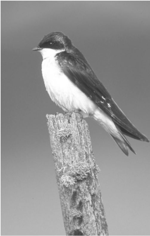
Figure 32. Tree Swallow, a widely distributed species in the North Peace River region, is most often found near bodies of water, large and small.

Habitat: Migration: Often recorded around wetlands including ponds, swamps, marshes, streams, rivers, and lakes. Cold wet weather often concentrated large numbers at such sites. Breeding: Cowan (1939) noted that Tree Swallows in the Tupper and Swan Lake areas were abundant around climax trembling aspen forests because of the availability of nest cavities excavated by Yellow-bellied Sapsuckers. Such is no longer the case in the South or North Peace River regions where old-growth trembling aspen has become very rare. During the period of this study, Tree Swallows were mainly recorded around snags in lakes or Beaver ponds and foraging over the sewage lagoons. The species also frequented urban environments where nest boxes were available.