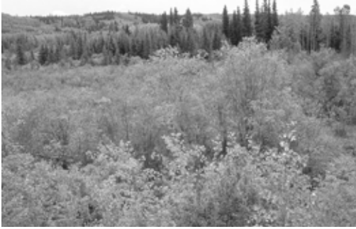
Figure 97. Chipping Sparrow migrates and breeds in a wide variety of habitats including openings in forests with dense shrubs. near Goodlow, BC, 18 June 1996.

Distribution: Migration and Breeding : Widely distributed throughout the North Peace River region.