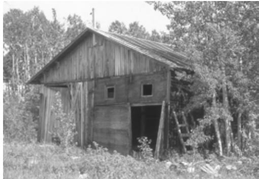
Figure 10. Most Eastern Phoebe nests in the North Peace River region were located in buildings, often abandoned, either on ledges outside or inside the structure. Photo by R. Wayne Campbell, Cecil Lake, BC, 24 June 1996.

Nests were built atop ridgepoles, rafters, or other horizontal supports inside open buildings or under eaves outside (Figure 13). Nests are cups of mud and straw lined with finer materials. Nests in natural sites blended so well with the surrounding earth of the bank that often it was very hard to determine where the nest stopped and where the bank began.