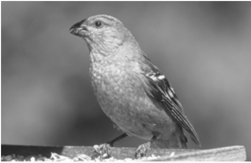
Figure 142. Pine Grosbeak, on occasion, may visit bird feeding stations in Fort St. John during bouts of severe weather.

Distribution: Migration and Winter : Widely distributed across the North Peace River region.