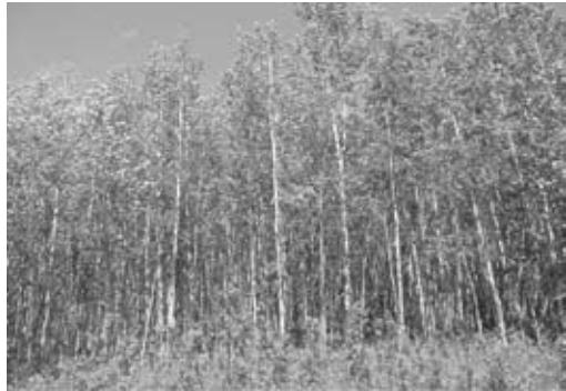
Figure 58. Veery, a locally distributed species, occurs mainly in young stands of trembling aspen.

Habitat: Migration: No records. Breeding: Appears restricted to deciduous forests, usually trembling aspen (Figure 58), with a border of willows and alder at a damp or wet site such as the interface of an aspen forest with sedge meadows around Boundary Lake, or a wooded swamp as along Upper Cache Road.