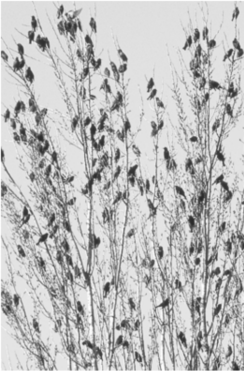
Figure 65. The largest flocks of European Starling are reported for the late summer to early autumn period, mainly in aggregations at pre-roosts.

Comment: European Starling was introduced into North America during the second half of the 19 th Century. Following introductions to Central Park, New York, in 1890 and 1891, the species became successfully established and began its remarkable spread across the continent. In 1952, this species was first recorded in the Peace River region of British Columbia about 10 km north of Dawson Creek (Campbell et al. 1997).