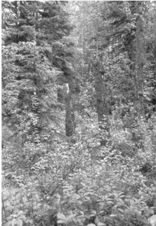
Figure 21. Mixed forests of trembling aspen, scattered with spruce and balsam poplar trees, are one of the many mixed forest types used by Warbling Vireos. Photo by R. Wayne Campbell, Beaton Park, BC, 21 June 1996.

and five along Peace Island Park Road on 21 May 1983. Summer: Breeding activities dominate June and early July. Southbound migration probably begins in late July and early August. Final autumn departure dates overlap between late August and early September. Notable records are three at Fish Creek on 17 June 1983, one chased Yellow Warblers at Beaton Provincial Park on 12 July 1983, one heard at Mile 115 Alaska Highway on 23 June 1984, and one juvenile at St. John Creek on 14 August 1986. Autumn: Six last autumn dates (1982 and 1984 to 1988) ranged from 23 August to 5 September. High single site counts for southbound migration numbered five or fewer birds. The latest departure date was a single bird at Boundary Lake on 5 September 1987.