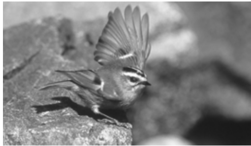
Figure 54. In summer, Golden-crowned Kinglet is a bird of mature spruce forests.

Golden-crowned Kinglet (Figure 54) was first found in the Peace River District by Cowan (1939) who described it as "very scarce" and recorded it at Tupper Creek and Charlie Lake. Penner (1976) found it an "uncommon summer" resident in the Peace River valley.