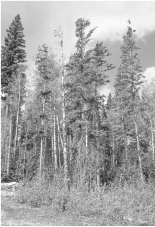
Figure 74. Magnolia Warbler breeds locally wherever mixed stands of spruce and trembling aspen occur.

Distribution: Migration: Uncommon throughout the southern half of the North Peace River region. It probably also passes through the northern half of the region. Breeding: The only evidence during the summer period was birds found along the Johnstone Road south of Taylor. The species is far more common eastwards from Chetwynd into the Rocky Mountains.