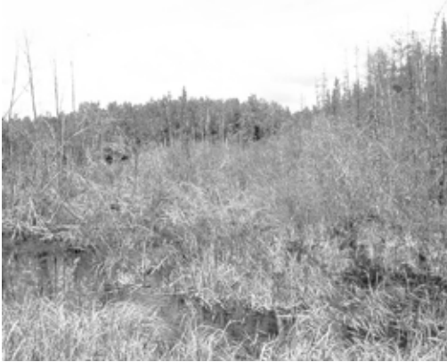
Figure 133. Remote woodlands, often with dead standing trees and tall shrubs, are breeding sites for Rusty Blackbird. near Boundary Lake, BC, 24 June 1996.

Habitat: Migration: Around ditches and ponds at woodland edges, farmyards (especially in wooded country), marshes and sloughs, lakeshores, muskegs, and wooded swamps in spring migration. In autumn, it is also observed around lakeshores and sewage lagoons. Breeding: Isolated wooded wetlands (Figure 133).