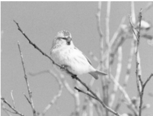
Figure 145. Hoary Redpoll is present most winters and sometimes in flocks of hundreds of individuals. Photo by Chris Siddle, Fort St. John, BC, 27 March 1982.

Hoary Redpoll (Figure 145) was not recorded by Williams (1933b), Cowan (1939), or Penner (1976) who researched the area only in spring and summer.