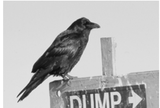
Figure 30. During the nonbreeding season, Common Raven is an opportunistic forager often taking up residence at sanitary landfills.

Habitat: Nonbreeding: Wilderness of most types, ranches, farms, sanitary landfills (Figure 30) and dumps, and other human settlements as well as open agricultural country. Breeding: Mature forests, rock and sandstone cliffs, industrial sites, residential areas, parks, and logging burns (Campbell et al. 1997).