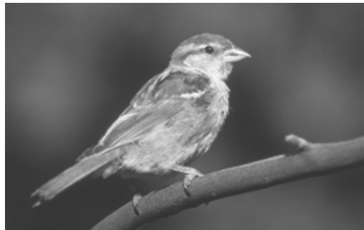
Figure 149. This juvenile male House Sparrow (note gape) is moulting into its familiar adult plumage.

and a large mass of sticks and twigs beneath eaves of a barn. These data were supplemented with observations of courtship, nest material gathering, copulations and fledged young (Figure 149). The nesting phenology is as follows: During mild late February or early March birds investigated cavities and initiated courtship activities. Earliest copulation was recorded was 2 March 1986 in Fort St. John. Nest-building occurred as early as late March. Eggs were laid during the first half of April. Hatching occurred from late April into early May, with young heard in nests from 26 April to 4 May. Earliest fledgling was on 14 May 1987. A brood of four fledglings was seen at the same site on 17 May 1987. One nest box in a Fort St. John backyard was cleaned out by a female on 18 March 1988. The male was seen courting the female on 12 April. The pair mated repeatedly on 17 April and young were first heard in the nest box on 4 May.