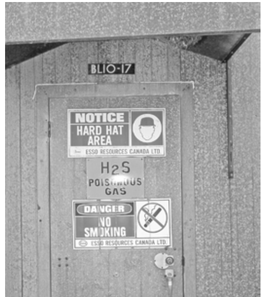
Figure 13. Eastern Phoebe readily uses structures built at oil and gas well sites for nesting throughout the North Peace River region. This nest, just visible in the upper right corner, was placed on a narrow ledge under the eave to the entrance of the structure. Photo by R. Wayne Campbell, Boundary Lake, BC, 27 June 2002.

Brown-headed Cowbird parasitism was not observed although Friedmann (1963) lists Eastern Phoebe as a "very common victim" and cited over 375 records for North America. Rothstein (1975) and Friedmann et al. (1977) further state that Eastern Phoebe is "often parasitized intensely by the Brown-headed Cowbird."