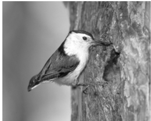
Figure 47. It is assumed that White-breasted Nuthatch arrived in northeastern British Columbia during the 1980s from northwestern Alberta.

Not recorded by Williams (1933b), Cowan (1939), or Penner (1976). The White-breasted Nuthatch (Figure 47) recently extended its range across Alberta into the Peace River area of British Columbia. It began to appear in the Grande Prairie area of Alberta from 1976 onwards (Pinel et al. 1993) and now is known to breed there (Semenchuk 1992). The first record for this study was one in mixed forest at the mouth of the Halfway River 26 April 1981.