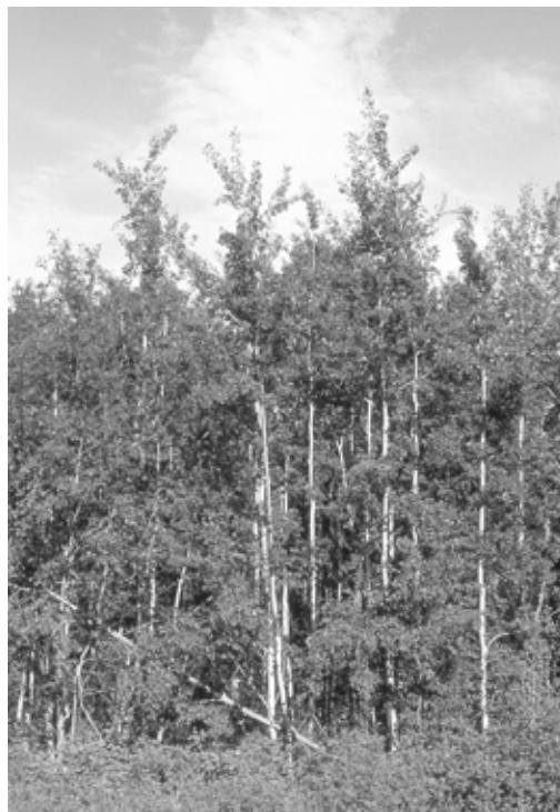
Figure 3. Western Wood-Pewee nests in young to middle-aged trembling aspen woodlands, usually building its nest near the edge of the stand. Photo by R. Wayne Campbell, Fort St. John, BC, 23 June 1996.

it was a bird of climax trembling aspen forest at Tupper Creek and Charlie Lake.