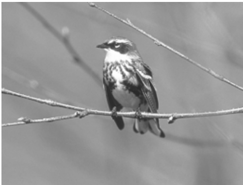
Figure 76. The white throat of the common "Myrtle" Yellow-rumped Warbler helps separate it from "Audubon's" subspecies, which is casual in the North Peace River region.

Williams (1932a) recorded the "Myrtle" Warbler (Figure 76) at Nig Creek on 22 and 23 May 1922. Cowan (1939) found "Myrtle" Warbler "characteristic of ... [the] avifauna of the black and white spruce habitats" of the Peace River District. Penner (1976) called the species an "abundant summer breeder" in the flood plain forests of the Peace River valley.