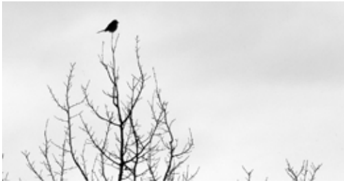
Figure 18. Most Northern Shrike records were obtained while scanning open habitats with patches of tall shrubs and clumps of small deciduous trees. south of Fort St. John, BC, 10 November 1996.

Occurrence: Spring: A definite movement begins in the fourth week of March with numbers peaking between 5 and 24 April. The highest single-day count during spring migration was 31 birds during a shrike survey of the North Pine-Montney area on 18 April 1982. Notable large numbers are 10 shrikes between Cecil Lake and Clayhurst on 5 April 1981 and 17 birds between North Pine and Cecil Lake on 17 April 1982. The final spring record for 1982 was three shrikes around Hudson's Hope on 24 April. Autumn: Ten early autumn arrival dates (1978, and 1980 to 1988) ranged from 17 September to 11 October, with seven dates between 23 September and 5 October.