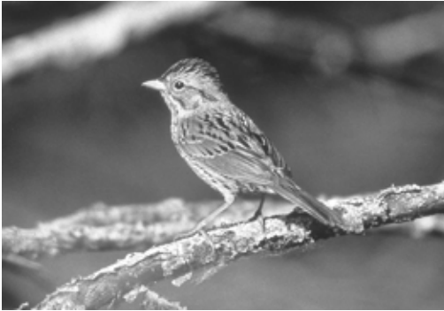
Figure 109. Although a common and widely distributed species, very few breeding records have been documented for Lincoln's Sparrow in the North Peace River region.

Not recorded by Williams (1933b). Cowan (1939) found it “a dominant member of the bird fauna” of all marshy areas with willows in the Peace River area. Penner (1976) called Lincoln's Sparrow (Figure 109) “fairly common” in the Peace River valley.