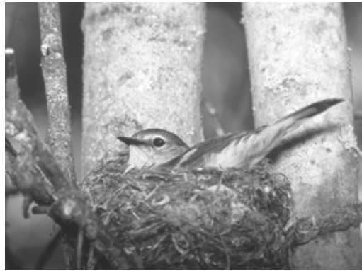
Figure 84. American Redstart is closely associated with brushy thickets, often near wetlands. Photo by R. Wayne Campbell, Beaton Park, BC, 23 June 1996.

In July 1930, Williams (1933b) found this species "common" around Moberly Lake west of the study area. Cowan (1939) considered American Redstart (Figure 84) the most abundant warbler in the Peace River District. Penner (1976) designated the American Redstart a "fairly common summer resident" in the Peace River valley.