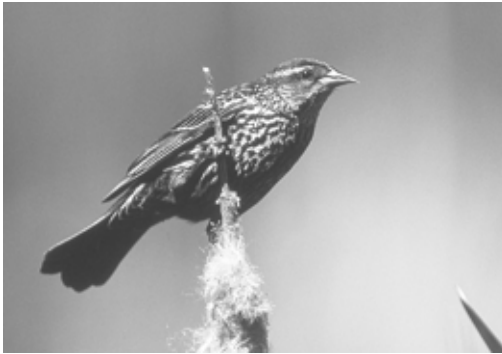
Figure 125. The earliest date for spring-arriving female Red-winged Blackbirds was 20 April, nearly two weeks later than for males. Photo by R. Wayne Campbell, south of Fort St. John, BC, 17 June 2004.

Williams (1933b) found this species “occasional” throughout the Peace River Block. Cowan (1939) called Red-winged Blackbird (Figure 125) an “abundant breeding bird” in the South Peace River region and at Charlie Lake. Penner (1976) found it a “common breeding bird” in the Peace River valley.