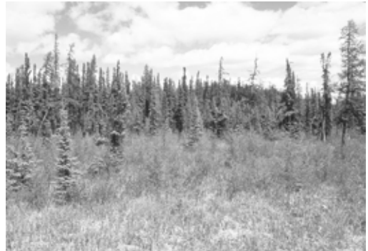
Figure 55. In summer, Ruby-crowned Kinglet is mostly found in the vicinity of spruce muskegs. Photo by R. Wayne Campbell, near Fort St. John, BC, 11 June 1996.

Habitat: Migration: Very widespread in brushy edge or wooded habitat including willow patches, and even suburban yards and gardens around Fort St. John and Hudson’s Hope. Breeding: Black spruce and black spruce-tamarack muskegs (Figure 55) are the home of the Ruby-crowned Kinglet during the nesting season. It was also found in white spruce dominated woodlands and possibly in stands of lodgepole pine.