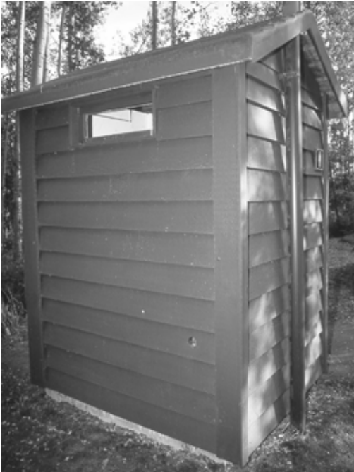
Figure 50. For many years, a pair of House Wrens nested in this outhouse in Beatton Park, BC. Access was through a small hole near the bottom (lower right) of the structure. Needless-to-say, a nest check had to be well timed! Photo by R. Wayne Campbell, 23 June 1998.

1973 as a date for seven eggs in a Charlie Lake nest (Figure 50). In the South Peace River, a nest with six eggs was observed on 28 June 1991 and another with seven eggs was observed 28 June 1994 (Phinney 1998). Similar dates likely apply to North Peace River region nests.