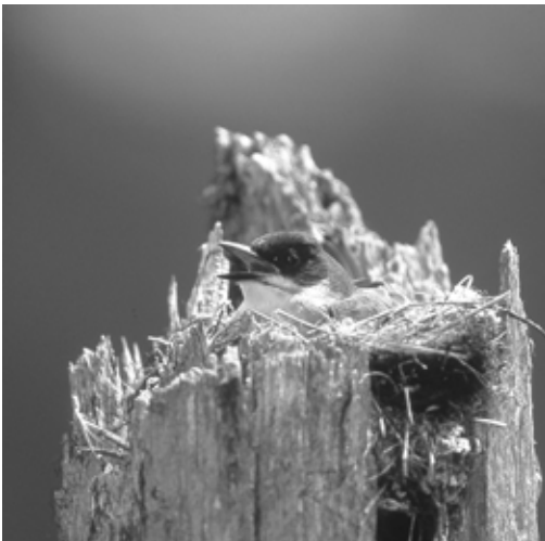
Figure 17. Eastern Kingbird often builds its nest in crevices or the top of snags surrounded by water. Photo by R. Wayne Campbell, Near Fort St. John, BC, 26 June 2004.

Breeding: There were six records of nests and another record of adults tending fledglings. Five nests were situated on snags (Figure 17) or dead bushes or trees over water. Heights above water were 0.1, 0.5, 0.6, 2.6, and 3.0 m. One nest, located about one km from a wetland, was placed in a broken snag, 6.0 m above the ground, in a brushy clearing in second-growth trembling aspen forest. Four wetland nests were placed in dead deciduous trees (trembling aspen, balsam poplar, and willow) and another in a dead white spruce sapling.