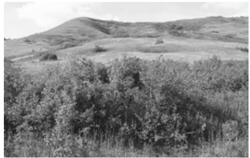
Figure 100. Thick patches of tall rose bushes, isolated in fields or along roadsides, are favourite breeding sites for Clay-colored Sparrow. west of Fort St. John, BC, 23 June 1996.

Habitat: Migration and Breeding: Found around thickets and patches of shrubs, wolf-willows, Saskatoon and rose bushes (Figure 100), brushy edges to fields, roadsides, hedgerows, and forest edges. It is a characteristic breeding bird of south-facing prairie-like "breaks" as well as being common in regenerating trembling aspen clear cuts.