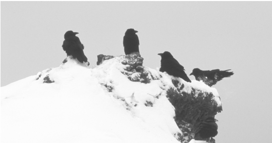
Figure 31. Roosting Common Ravens silhouetted on white snow is a common sight in the North Peace River region. Photo by R. Wayne Campbell, Fort St. John, BC, 12 November 1996.

Comments: Aggregations of ravens gather at food sources, including dead livestock (mainly horses and cows) or game carcasses such as Mule Deer and Moose. Bald Eagles, Golden Eagles, Black-billed Magpies, and Gray Jays join such gatherings. On 4 September 1988, 30 Common Ravens were observed eating from a dead Moose at km 2 of the Upper Cache Road. Smaller carcasses are also attended. During 1980, when Snowshoe Hares ( Lepus americanus ) were at the peak of their population cycle, ravens were frequent along the Alaska Highway and Highway 29 feeding on hares killed by collisions with vehicles. Flocks of ravens also form at landfills throughout the region. The largest flock away from a landfill was of 70 associated with a herd of Hereford cattle at km 21 along the Upper Cache Road on 19 February 1983.