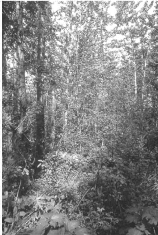
Figure 92. Fledged Canada Warbler young were found in the dense shrub layer in this mixed stand of trembling aspen and balsam poplar. The nest may have been located under the fallen log (bottom centre) where other nests have been found in the south Peace River region. Photo by R. Wayne Campbell, south of Taylor, BC (along Johnstone Road), 11 June 2007.

Breeding: Most breeding evidence is of family groups. These include: A pair feeding two or three fledglings on south side of the Peace River about 8 km downstream from Farrell Creek on 21 July 1992; a female feeding a still slightly downy fledgling on south side of the Peace River, about 10.5 km east from Farrell Creek, on 21 July 1992; an agitated male carrying food at km 6.4 of the Johnstone Road (Figure 92) on 2 July 1980; a female collecting food at km 6.5 Johnstone Road on 2 July 1980; and a male and female carrying food at km 5 of the Johnstone Road on 8 July 1984. In addition, a female Canada Warbler was seen feeding a fledged Brown-headed Cowbird along Johnstone Road in July 1982 and 1983.