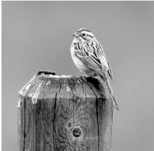
Figure 99. In British Columbia, the highest numbers of Clay-colored Sparrow in summer occur in the Boreal Plains ecoregion.

Not reported by Williams (1933b). Cowan (1939) felt Clay-colored Sparrow (Figure 99) was the most abundant sparrow in the eastern part of the Peace River District. Penner (1976) found it an "abundant summer resident" in the Peace River valley.