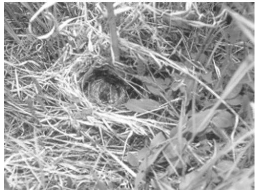
Figure 111. Lincoln’s Sparrow nests (centre) are built on the ground usually at the base of dead grasses. east of Hudson’s Hope, BC, 18 June 1996.

Nests are built in small depressions on the ground (Figure 111). A nest along Johnstone Road was placed beneath a cover of forbs and situated at the edge of a bush on a gentle slope covered with a regenerating trembling aspen forest in an old clearing. A nest at Boundary Lake was in mosses at the base of a tiny black spruce sapling near the brushy edge of a muskeg.