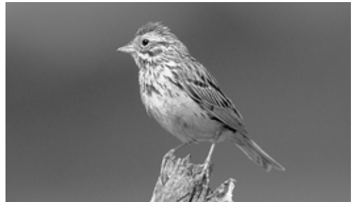
Figure 103. Savannah Sparrow is a familiar bird from spring to autumn each year in open habitats.