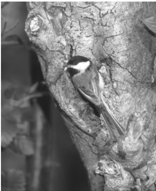
Figure 45. Adult Black-capped Chickadee removing a fecal sac from its nest in a decaying deciduous stub.

seen as early as 10 April 1976 at Stoddart Creek in Fort St. John. Nests sites have been located in snags or stumps where the decaying wood is soft (Figure 45). Active nests have been found in a large willow along a stream; 6 m up a balsam poplar snag at Taylor Landing Provincial Park on 19 May 1983; in a detached rotten trembling aspen top trunk suspended in the woods at Stoddart Creek in Fort St. John in mid-April 1976; and in a rotting trembling aspen at Stoddart Creek in Fort St. John on 24 April 1983. Cowan (1939) found a nest with seven eggs in a rotten willow stump at Tupper Creek, South Peace River region on 18 May 1938. Nests containing eggs and/or nestlings occurred from mid-to-late May in the South Peace River region where a nest with one large chick was examined near Dawson Creek on 24 May 1995 (Phinney 1998). All sites were located in mixed woodlands. Ten broods of fledged young, still being fed by their parents, were encountered from 9 June to 12 July, with eight of these observed between 9 and 22 June. Fledged family size ranged from one to five young.