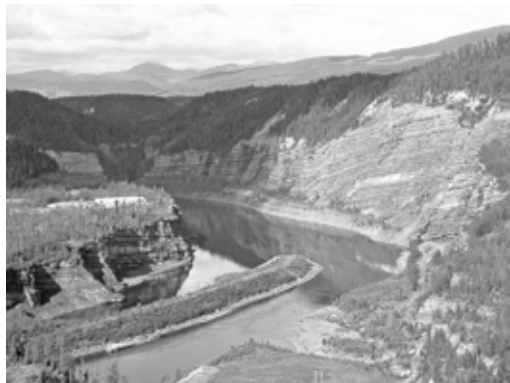
Figure 36. The steep-walled cliffs at the south end of Williston Lake, BC, near the W.A.C. Bennett dam, with their numerous crannies and fissures, attract many nesting Violet-green Swallows.

Distribution: Migration: Regular in the Peace River valley from Site One dam (Figure 36) east to Alces Creek near the Alberta border. The species is most frequent in the western half of the valley to about the Halfway River, becoming more locally distributed to the east. It is irregular and rare outside the valley. All upland records have been within 22 km and more usually five to 10 km of the Peace River valley. Violet-green Swallow is a regular visitor at Alwin Holland Park east of Hudson's Hope, Lynx Creek, Farrell Creek, Watson Slough, Bear Flat, Tea Creek Ravine, and near the confluence of Beatton River with Stoddart Creek. Individuals were also occasionally seen at Charlie Lake, Fort St. John (including both sets of sewage lagoons), Taylor, Boundary Lake, and Alces Creek near the Clayhurst Bridge. Breeding: Restricted to the Peace River valley and some of its tributaries (Beatton River and Tea Creek). Nesting has been confirmed on the teapot rocks in the river at Alwin Holland Park, Bear Flat, on the Peace breaks west of Charlie Lake, Tea Creek Ravine (Grand Haven) and near the confluence of the Beatton River with Stoddart Creek. Other breeding sites likely occur along the Peace River to the Alberta border.