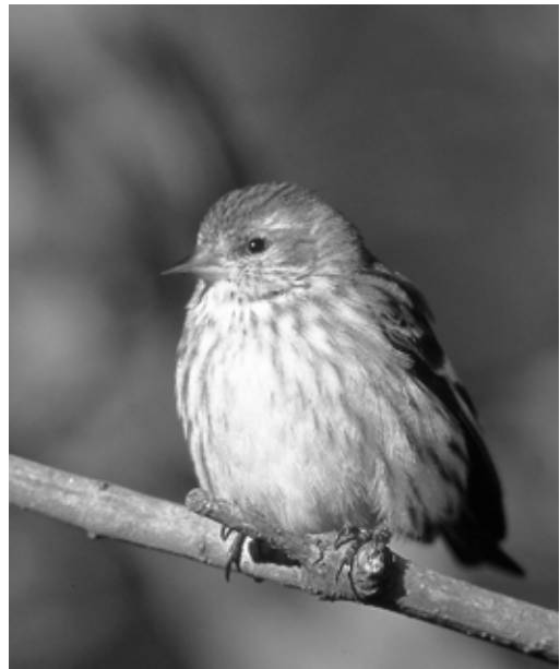
Figure 146. Pine Siskin, an irruptive species, occurs throughout the region each year from spring to autumn but in unpredictable numbers.

Habitat: Migration and Breeding : Most forest types including trembling aspen groves, black spruce muskeg, mature balsam poplar floodplain forests, mixed woodlands, and pure stands of mature white spruce. It has been recorded feeding on birches from August to October, alders in September, dandelion seeds in June, balsam poplar seeds in July, and willow seeds in late May.