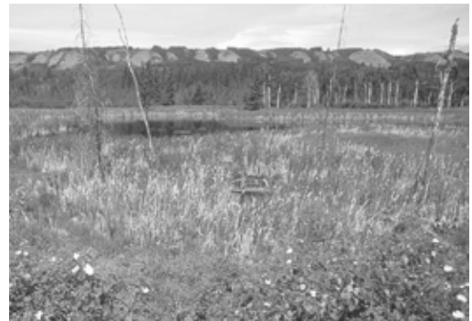
Figure 16. This productive wetland provides a variety of invertebrates as food, and snags and dense shrubs as nesting sites for Eastern Kingbird. Watson Slough, BC, 28 June 2002.

Eastern Kingbird is locally distributed around wetlands (also a few dry sites) from Hudson’s Hope in the west to the Clayhurst area in the east. It also occurs on the south banks of the Peace River north to about North Pine but was not found farther north. Breeding was confirmed at Watson Slough (Figure 16), Charlie Lake, and 251 Road southwest of Cecil Lake.