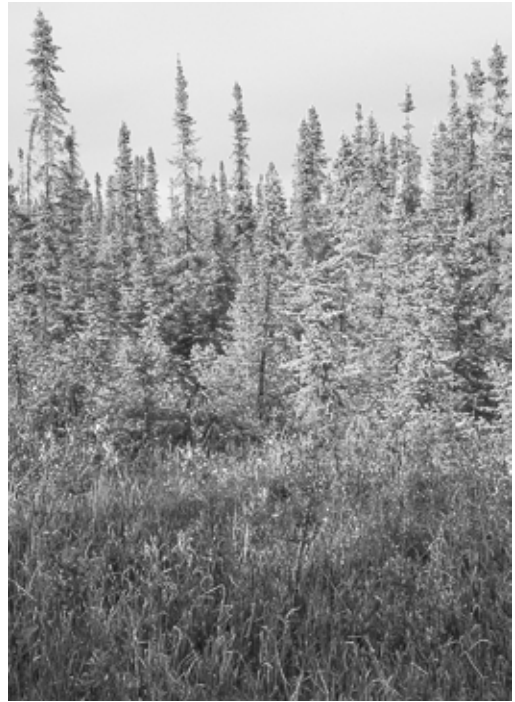
Figure 107. The shrubby edges of black spruce muskeg is one of the various breeding habitats for Fox Sparrow. Lost Lake, BC, 27 June 2002.

Habitat: Migration: Thickets along forest or wetland edges. Breeding: Brushy edges of black spruce muskeg around Lost Lake (Figure 107), German Lake and Boundary Lake. Males selected tall spruce snags as song perches. On the south side of the Peace River, Fox Sparrow frequented willows and alders growing as thickets around backwater channels as well as the understory of mature balsam poplar floodplain forests. Around Cecil Lake and Charlie Lake, Fox Sparrow was found in deciduous thickets along the shore and marshy outlets, a habitat similar to that described by Cowan (1939) for the South Peace River region.