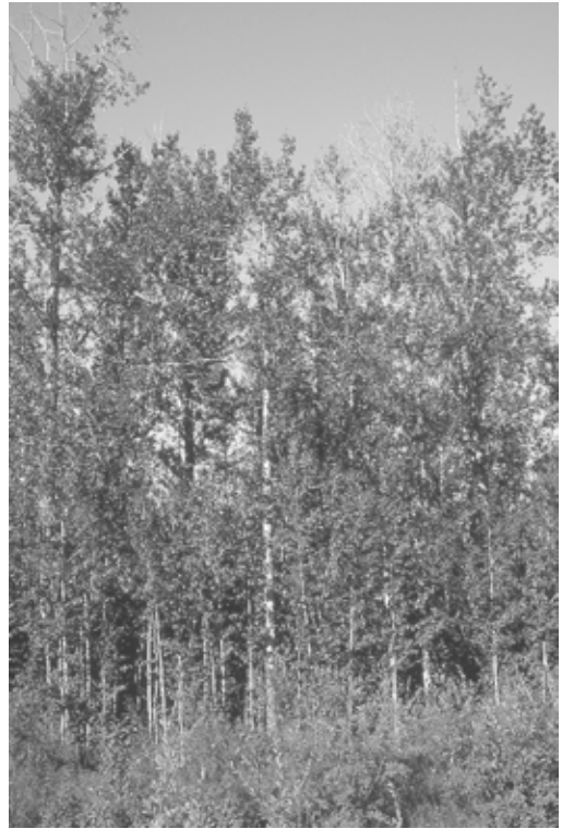
Figure 83. Mixed young and mature trembling aspen and balsam poplar forests associated with willow is the preferred habitat for Black-and-white-Warbler. near Taylor, BC, 28 June 1998.

Habitat: Migration: Deciduous or mixed woodland edges as well as willow thickets in both dry and wet situations. It is also often seen in the dead tops of partially drowned willows in riparian habitat. Breeding: Young and mature trembling aspen forests (Phinney 1998; Figure 83), especially in damp or riparian situations where birch, alder, and willow grow, and mature balsam poplar flood plain forests and mature mixed forests. The species spends little time in conifers (Salt 1973).