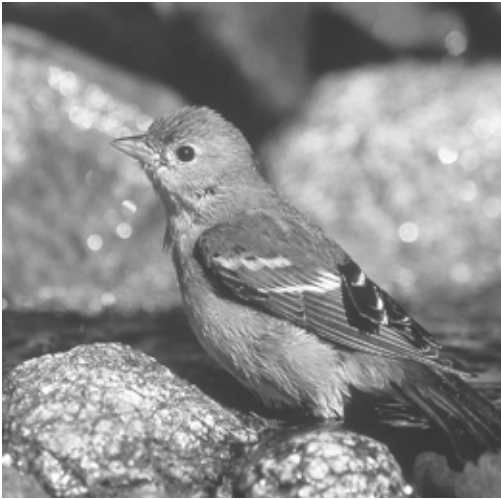
Figure 93. Western Tanager is more common as a migrant than a breeding species in the North Peace River region.

This species was recorded once in the Peace River District by Williams (1933b), near Moberly Lake. It was recorded by Cowan (1939) in the South Peace River region and at Charlie Lake but no status was given. Penner (1976) described Western Tanager (Figure 93) as a "fairly common" breeding bird in the forests along the Peace River valley.