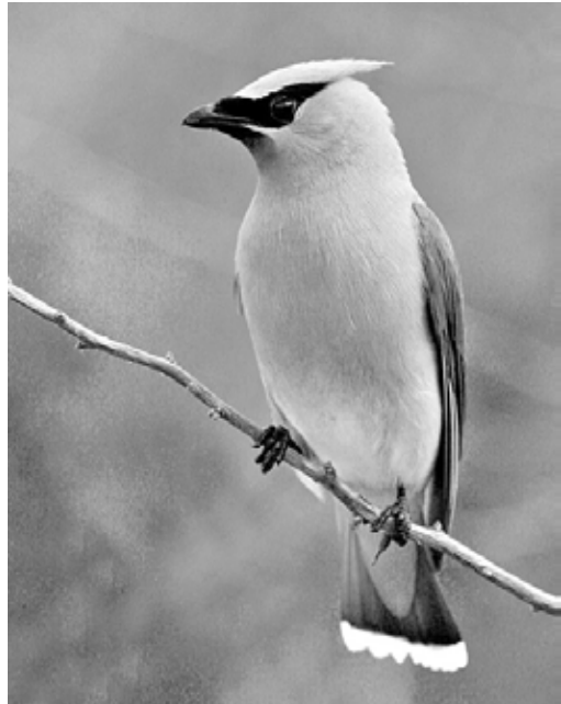
Figure 68. Until the late 1930s, Cedar Waxwing was not known to occur in northeastern British Columbia.

Breeding: No nests were found. Two recently fledged young fed by an adult at Alwin Holland Park on 8 September 1979 must have hatched in late August. In the South Peace River region, Phinney (1998) found nests with eggs between 15 June and 4 July. Old nests were often located in willows or trembling aspen saplings close to the forest edge.