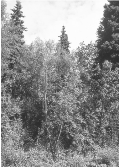
Figure 79. Black-throated Green Warbler breeds in mature white spruce forests containing a mixture of younger trembling aspen and balsam poplar trees. south of Hudson's Hope, BC, 18 June 1997.

Occurrence: Spring: Eleven earliest arrival dates (1979 to 1989) ranged from 9 to 21 May, with seven dates between 10 and 17 May. Phinney (1998) gave 11 May 1992 and 1993 as early dates for the Dawson Creek area. Penner (1976) gave 9 May as the earliest spring arrival for the Peace River valley. Spring numbers generally indicate birds on territory rather than a suggestion of passage migrants. Highest spring numbers occurred very shortly after first arrival. Notable records are: Four males were singing along Peace Island Park Road on 22 May 1982 (only seven days after the first bird arrived), a male at Clayhurst bridge on 17 May 1981, and a male along the Peace Island Park Road on 9 May 1987. Summer: See Breeding . Southbound migration began shortly after the middle of August although records are few. Records of single immature birds occurred