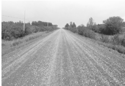
Figure 117. The grassy and weedy edges of gravel roads criss-crossing the North Peace River region are used in spring and autumn by transient White-crowned Sparrows.

Distribution: Migration: Recorded throughout the North Peace River region.