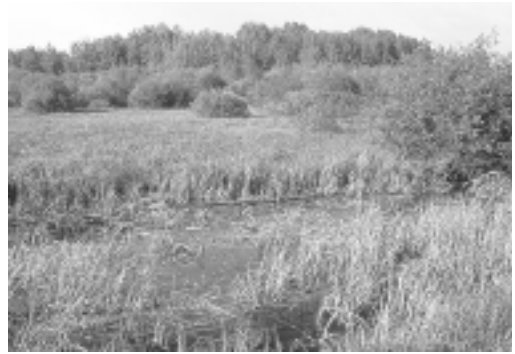
Figure 77. In spring and autumn migration, "Myrtle" Yellow-rumped Warblers frequently forage in shrubby thickets bordering wetlands. Photo by R. Wayne Campbell, near Fort St. John, BC, 22 June 1996.

Habitat: Migration: Most woodlands as well as thickets and edges in open country, including backyards, gardens, live and dead trees around ponds and lakes (Figure 77), and occasionally edges of beaches and lawns. Breeding: Found in a variety of forest types: almost pure stands of mature white spruce; mixed conifers including tamarack, black spruce, and white spruce; edges of muskegs; mature mixed woodlands of trembling aspen, balsam poplar, spruce and birch; young and mature trembling aspen forests; and woodlands dominated by lodgepole pine.