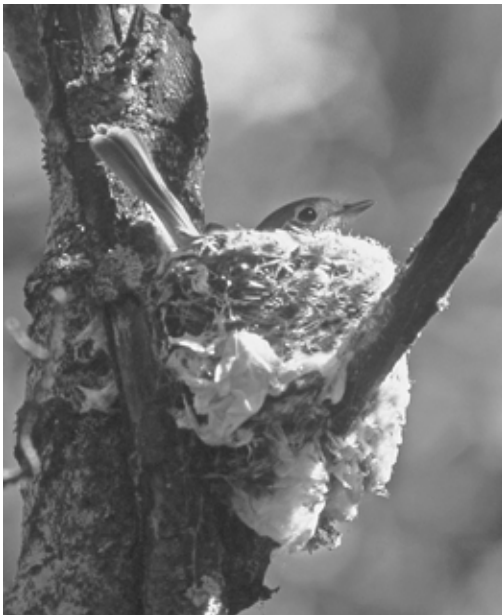
Figure 7. The typical location for a Least Flycatcher nest in the North and South Peace River region of British Columbia is the upright crotch of a deciduous tree.

Breeding: There were eight records of nests with contents and 19 records of adults feeding fledglings. Nests were usually situated in upright crotches of deciduous trees (Figure 7) including trembling aspen (3), willow (1), birch (1), alder (2), and a snag (1). Nest heights ( n=8 ) ranged from 2.4 to 8 m. Nest-building was recorded three times between 24 May and 2 June.