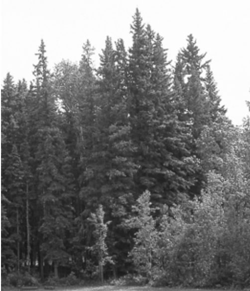
Figure 75. In Beatton Park, BC, tall clumps of white spruce adjacent to park openings attract Cape May Warblers. 23 June 1996.

1996). In Alberta, Salt (1973) described Cape May Warbler as a bird of dense spruce stands composed entirely of mature trees, but adds that “relatively open woods with poplars and birch interspersed among the conifers” are equally acceptable as long as there are a few taller spruces whose spires rise above the canopy. These are used as song perches. In the North Peace River region, there were only two records of birds in mixed woodlands.