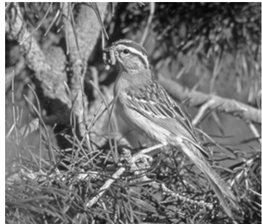
Figure 96. Chipping Sparrow is less common as a summer visitor than as a migrant species.

Williams (1933b) found this species "common" along the Peace River. Cowan (1939) noted flocks of up to 20 migrants around Swan Lake, but felt it was scarce after migration. At Charlie Lake, he listed Chipping Sparrow (Figure 96) as the least abundant nesting sparrow. Penner (1976) termed it a "common migrant and summer resident" in the Peace River valley.