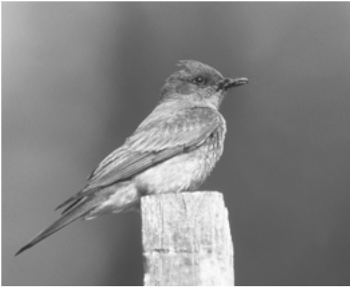
Figure 14. Say's Phoebe is a transient species, passing through the North Peace River region in late spring and again in late summer. Photo by R. Wayne Campbell, Cecil Lake, BC, 27 July 1996.

Habitat: Migration: Fields, roadsides, and edges along adjacent open areas. There was one record of a bird in an open black spruce muskeg.