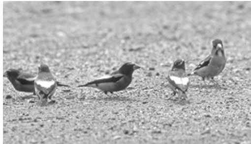
Figure 147. Often Evening Grosbeaks are encountered along gravel roads where small flocks can be watched picking up minute granules of sand or stone where they are vulnerable to traffic collisions.

Not listed by Williams (1933b). Cowan (1939) recorded only two birds, on 20 May 1938 at Tupper Creek. Penner (1976), however, listed Evening Grosbeak (Figure 147) as an "uncommon resident" in the valley of the Peace River.