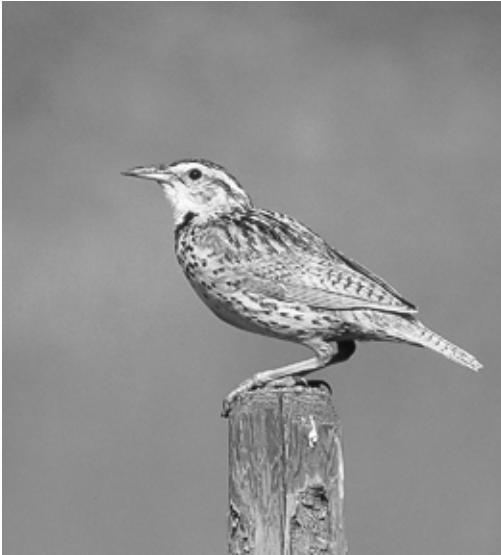
Figure 128. Western Meadowlark is a recent arrival in the North Peace River region, probably as part of expansion in northwestern Alberta.