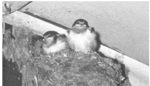
Figure 43. Barn Swallow is a well-established breeding species in agricultural and urban habitats. near Fort St. John, BC, 7 July 1986.

Breeding: Fourteen nests (Figure 43) and one record of recent fledglings were recorded. Notable nesting records include a pair lining a nest built in the cab of a bulldozer at km 15.5 of Upper Cache Road on 9 July 1983, a pair nesting in a warehouse at Fort St. John on 5 June 1985, four large young flushed from a nest at 248A Road marshes near North Pine on 6 July 1983, a nest with five eggs at German Lake on 13 June 1987, and a nest containing four large chicks at Clayhurst bridge over the Peace River on 2 July 1998.