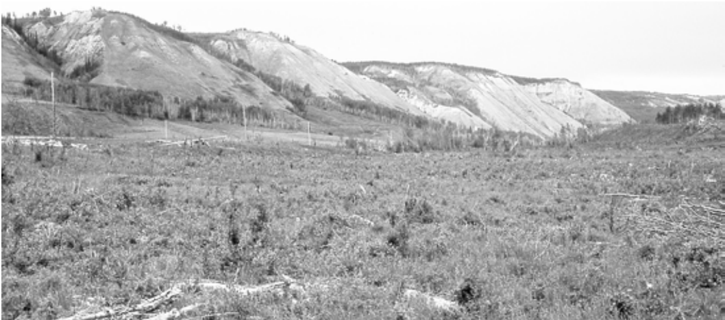
Figure 110. Regenerating clearings, with fallen branches and trunks and a lush herbaceous growth, are used by Lincoln's Sparrow for breeding. east of Hudson's Hope, BC, 18 June 1997.

Habitat: Migration: See Breeding . In migration, may occur in more open country and in smaller patches of habitat including hedgerows, lines of willow, and shrubby edges around roads, grain elevators, and ponds. Breeding: A range of habitats from large brushy, overgrown city lots often adjacent to playing fields and wooded parks (e.g., Fort St. John) and regenerating clearing (Figure 110), to muskeg edges (e.g., Boundary Lake). It also likes damp sites including edges to trembling aspen forests (e.g., Johnstone Road), shrubby and grassy transmission corridors, semi-open patches of willow shrubs and long grasses along creeks (e.g., St. John Creek), willow thickets around a lake (e.g., Charlie Lake), brushy marsh edge (e.g., Boundary Lake and 248A Road marshes), and brush around beaver ponds (e.g., Old Hudson's Hope Road east of Bear Flat).