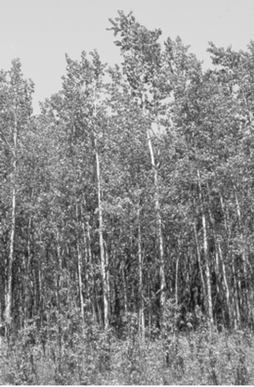
Figure 23. The primary breeding habitat for Philadelphia Vireo includes deciduous forests, especially at the edge of pole-stage to mature trembling aspen forests. Photo by R. Wayne Campbell, 25 June 1996.

Distribution: Migration: This species may occasionally be found in mixed migrant flocks of warblers and other vireos. It is uncommonly encountered across the study area. Breeding: Poorly known. Philadelphia Vireo is locally distributed across the southern third to mid-North Peace River region.