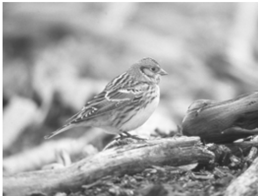
Figure 120. Lapland Longspur passes through the North Peace River region to and from its Arctic breeding grounds mainly during the first two weeks of April and September each year.

A flock was recorded by Williams (1933b) on 16 May 1922. It was recorded by Cowan (1939) as an "abundant migrant" in the South Peace River region with migration concluded by 10 May 1938. Lapland Longspur (Figure 120) was not found by Penner (1976) in the Peace River valley.