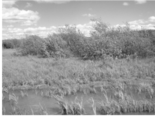
Figure 106. Nelson's Sparrow, formerly known as Nelson's Sharp-tailed Sparrow, occurs locally in sedge wetlands with adjacent willows. east of Fort St. John, BC, 16 June 1996.