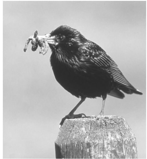
Figure 64. European Starling was first recorded in the Peace River region of British Columbia in 1952. Since then, the species has become a common sight from spring to autumn each year.

Williams (1933b), Cowan (1939) and Penner (1976) did not record European Starling (Figure 64).