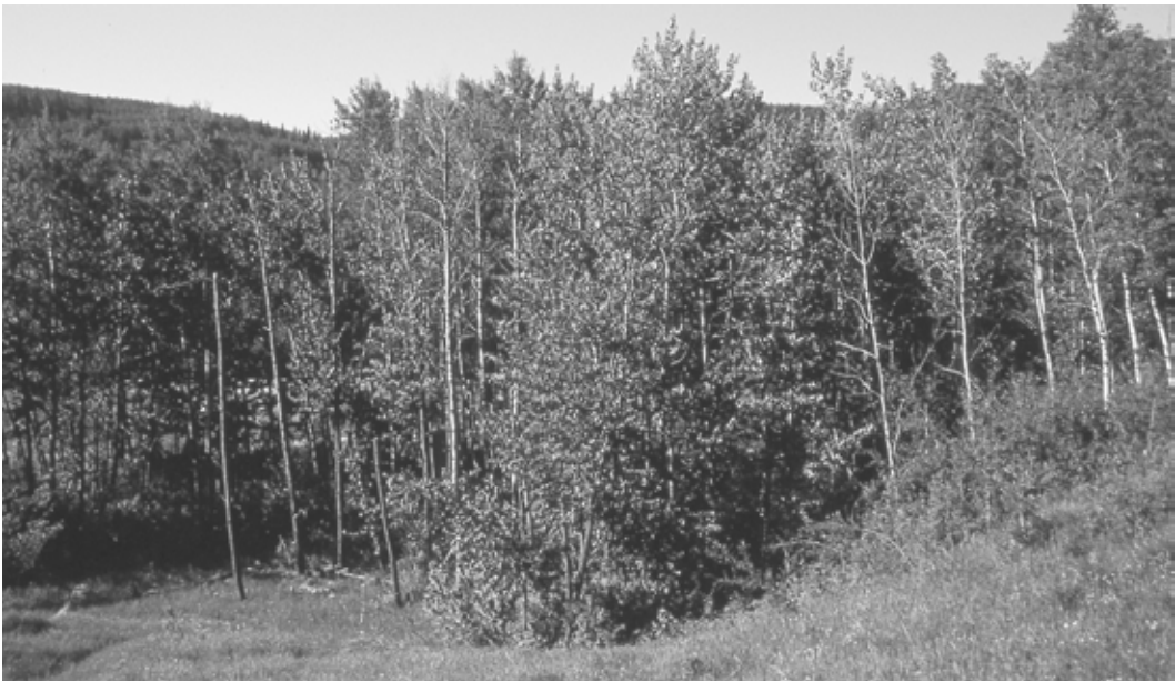
Figure 8. Since its arrival in the North Peace River region in 1974, Pacific-slope Flycatcher has included stands of mature trembling aspen and balsam poplar as its summer habitat east of Fort St. John, BC, 8 June 2005.

Comments: Western Flycatcher ( E. difficilis ) was split into Pacific-slope Flycatcher and Cordilleran Flycatcher ( E. occidentalis ) based upon differences in vocal, morphological and allozyme characters (American Ornithologists’ Union 1989, Lowther 2000). Supposedly, the two forms were reproductively separate. Subsequent investigations in interior British Columbia have suggested that many flycatchers in this region have hybrid characteristics. Recently analysis of multilocus DNA revealed hybridization in a contact zone across southern interior British Columbia and southern Alberta (Rush et al. 2009).