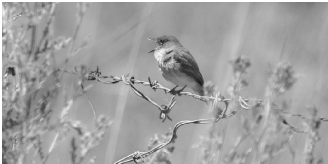
Figure 9. Eastern Phoebe arrives in the Peace River region of British Columbia in late April and early May and may depart as early as late July with most southward migration occurring during August.

Occurrence: Spring: Earliest arrival dates (1976, 1978, and 1980 to 1989) ranged from 25 April to 10 May, with eight dates between 25 April and 4 May. Most arrival dates are from traditional breeding sites, which are often sheltered and south-facing, allowing maximum ambient temperatures to be achieved during early spring days. There were no observations of spring aggregations. Eastern Phoebe is widespread by the second week of May. Territorial defense and egg-laying occurs in May. Notable spring arrival dates are one at Hudson’s Hope on 26 April 1986, one near the mouth of Farrell Creek on 27 April 1980, one at Beatton Provincial Park on 29 April 1984, two along Peace Island Park