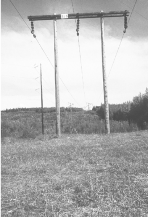
Figure 115. The brushy edges of transmission corridors are regular foraging sites for transient Harris's Sparrow each autumn. south of Hudson's Hope, BC, 1 June 2003.

Habitat: Migration: Brushy hedgerows, willow lines, brushy transportation and transmission corridors (Figure 115), woodland edges, and brushy re-generating clear cuts.