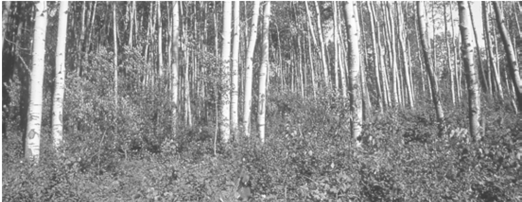
Figure 114. Mixed-age stands of semi-open trembling aspen are the preferred summer habitat for White-throated Sparrow.

Cowbird parasitism on White-throated Sparrow is infrequently reported, but with four of nine Peace River nests parasitized, it may be more significant than was previously recognized.