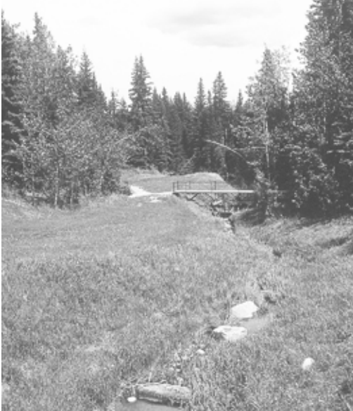
Figure 94. Migrating and breeding Western Tanagers are most often found in mature mixed forests. Stoddart (Fish) Creek, BC, 12 June 2007.

Breeding: Western Tanager is probably a widespread breeding species. Nest-building began as early as late May and fledglings appeared in early July. No nests were located, but breeding evidence included a female building a nest 19 m high in a mature white spruce in mixed woodland at km 5 of the Johnstone Road on 23 May 1983, a female feeding a newly fledged chick in Beaton Provincial Park on 4 July 1981, a pair carrying food and acting agitated at St. John Creek near 101 Road on 6 July 1976, a male feeding a begging fledgling in a stand of lodgepole pine at Hudson's Hope on 1 July 1998, and a pair of adults accompanied by two juveniles foraging along Peace Island Park Road on 5 July 1998. Phinney (1998) found a nearly completed nest on 2 June and a female incubating eggs or brooding nestlings on 12 July in the Dawson Creek area. There were two records of Brown-headed Cowbird parasitism. A pair of tanagers fed two newly fledged cowbirds along Peace Island Park Road on 22 July 1985 and a female fed a juvenile cowbird at Beaton Provincial Park on 10 July 1980.