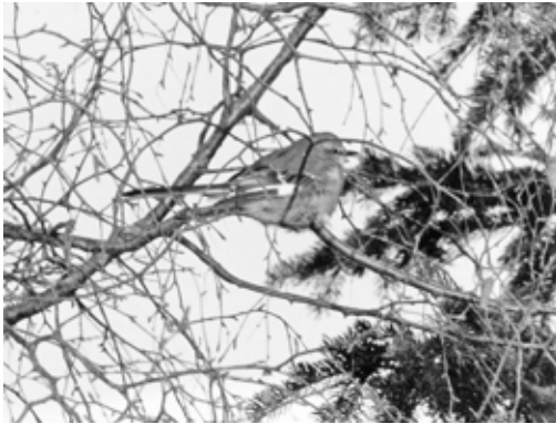
Figure 63. Northern Mockingbird was first reported in in the Peace River region of British Columbia during the 1980s. Photo by Chris Siddle, Fort St. John, BC, 11 November 1982. BC Photo 3738.

Not previously recorded in the North Peace River region.