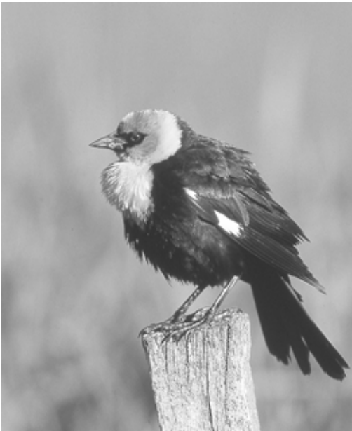
Figure 130. Yellow-headed Blackbird expanded its range into the North Peace River region starting in the late 1970s. A decade later it was a common, but local, breeding species.

Not recorded by Williams (1933b), Cowan (1939), or Penner (1976), and not listed by Munro and Cowan (1947) or Godfrey (1966), indicating Yellow-headed Blackbird (Figure 130) recently expanded its range into the Peace River area. See Campbell et al. (2001) for further comments about its range expansion into the Peace Lowland.