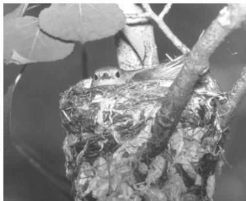
Figure 72. Yellow Warbler is a common breeding species in the shrubby understory of deciduous woodlands. Photo by R. Wayne Campbell, Beaton Park, BC, 23 June 1996.

Distribution: Migration and Breeding: Occurs throughout the North Peace River region in suitable habitat (Figure 72).