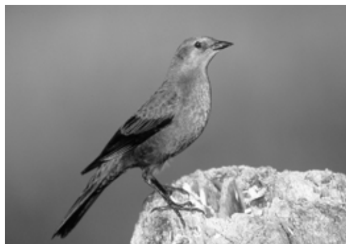
Figure 134. Brewer's Blackbird arrived in the Peace River region of British Columbia, probably from northwestern Alberta, during the 1950s.

Habitat: Migration: Agricultural fields, roadsides, and occasionally lakeshores. Breeding: Territorial birds forage in fields, around farms, and sometimes large yards, and often nest in trees and thick shrubs in overgrown meadows.