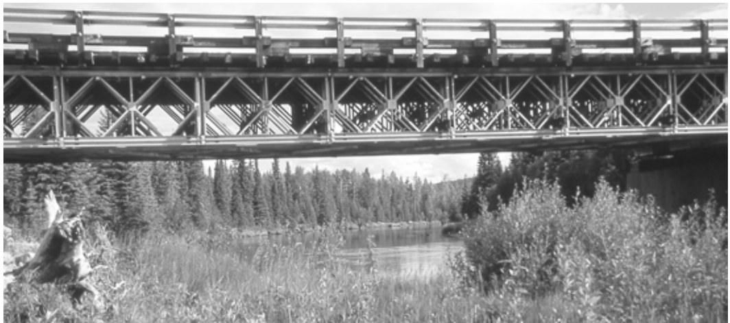
Figure 12. At some sites, notably under bridges spanning small and large rivers and creeks, Eastern Phoebe has been known to nest for a decade or more. Photo by R. Wayne Campbell, Cypress Creek, BC, 27 June 1998.

Four nests with eggs were found between 30 May and 11 July. In addition, Cowan (1939) reported eggs as early as 12 May 1938 and Phinney (1998) on 25 May in the South Peace River region. Two North Peace River region nests contained four eggs and two contained five eggs, but it is not known whether these were complete clutches. Elsewhere in its range, the Eastern Phoebe lays two to six eggs, with five the mode (Weeks 1994). Nests with nestlings ( n=8 ) were found from 5 June (Campbell et al. 1997) to 2 August with five broods recorded between 5 and 24 June. Five records of adults attending fledged, dependent young occurred between 3 and 13 July and represent the period of first broods' post-fledging parental care in the North Peace River region. Four broods, recorded between 20 July and 2 August, probably represent second nestings, as this species is typically double-brooded (Weeks 1994). One fledged chick attended by two adults on 18 August was the latest breeding-related observation.