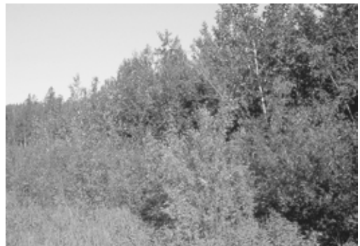
Figure 89. Pure or mixed forests with a dense, well-grown shrubby edge, is the habitat most frequently associated with Mourning Warbler. Photo by R. Wayne Campbell, north of Fort St. John, BC, June 1996.

Habitat: Migration and Breeding : Mourning Warbler was found in thick shrubbery along the edges of woodlands, in overgrown transmission corridors, willow thickets backed by mature mixed forest and less frequently in the understory of trembling aspen woodlands usually near an opening in the canopy. Most commonly the species is found in willow, alder, and red-osier dogwood shrub edge of mixed forest of mature balsam poplar, trembling aspen and white spruce (Figure 89).