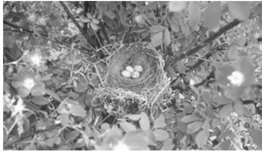
Figure 101. A careful examination of dense patches of rose bushes will undoubtedly contribute to the nesting biology and phenology of Clay-colored Sparrow in the North Peace River region.