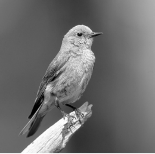
Figure 56. Mountain Bluebird is a familiar species throughout the southern interior of British Columbia, but becomes rare in the Peace River region of the province.