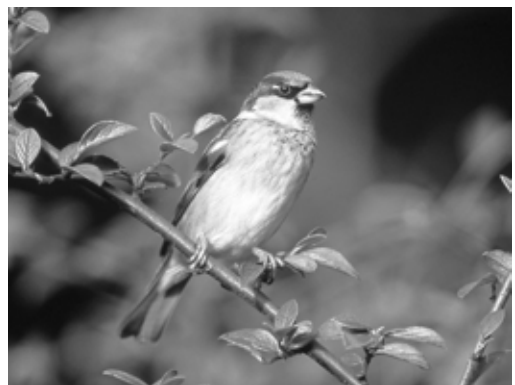
Figure 148. Humans and House Sparrows are synonymous and the North Peace River region is no exception, where the species is present year-round.

House Sparrow (Figure 148) was seen by Williams (1933b) at East Pine, Dawson Creek, and Fort St. John in 1929 and at Taylor Flat and Moberly Lake in 1930. Cowan (1939) called it "abundant" in towns and villages throughout the Peace District in 1938. Penner (1976) found it "rare" in undisturbed habitats along the Peace River valley.