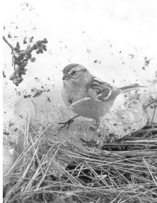
Figure 95. American Tree Sparrows pass through the North Peace River region as transients from mid-April to early May and mid-September to early October.

Williams (1933) listed a male taken at Dawson Creek on 13 September 1930. Cowan (1939) and Penner (1976) did not record American Tree Sparrow (Figure 95) because of the timing of their field work.