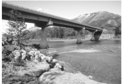
Figure 40. Both natural and human-created sites are used for nesting by Cliff Swallow. This bridge, over the Beatton River east of Fort St. John, BC, supports a nesting colony of over 100 pairs. 10 June 2007.

Distribution: Migration: Most commonly encountered over the Peace River and wetlands across the study area. Breeding: Colonies are widely distributed, but local, in the Peace River, Lynx Creek, Halfway River, Tea Creek, Beatton River (Figure 40), Stoddart Creek, Blueberry River, and in settlements of Fort St. John and Wonowon.